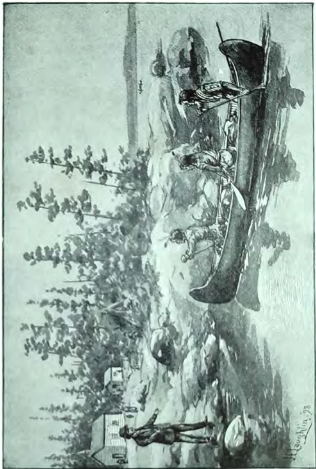
DEPUTATION OF INDIANS PLEADING FOR A MISSIONARY.