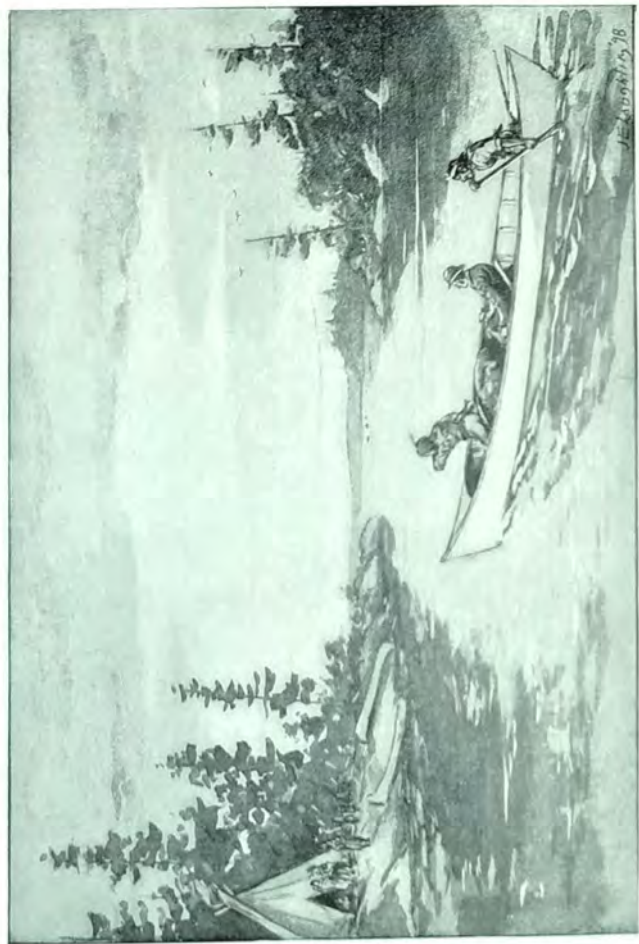
'THE ISLAND OF LIGHT' — THE TIN-CANOE.