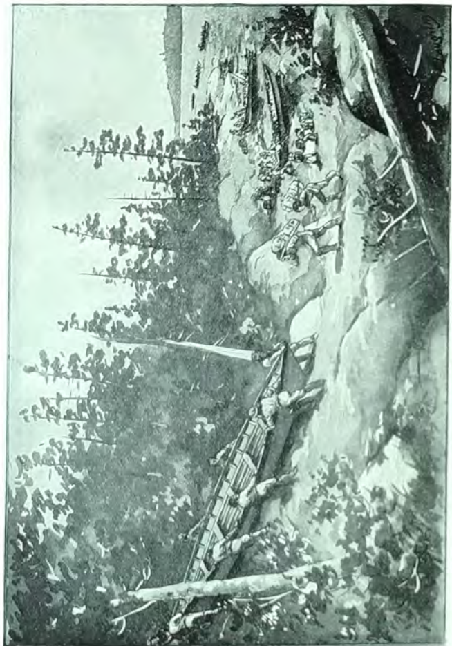
INDIAN BRIGADES CROSSING A PORTAGE.