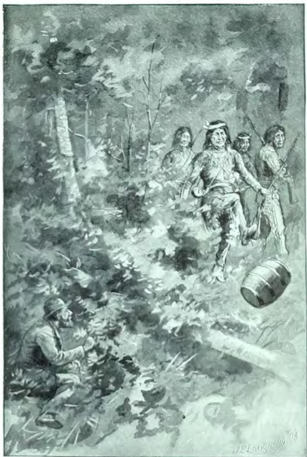
FOUR INDIANS AND THE KEG OF WHISKEY.