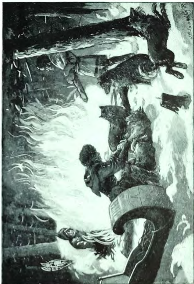
SHOEING THE DOGS.