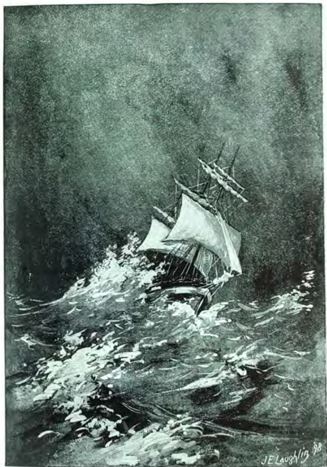
STORM IN THE BALTIC SEA.