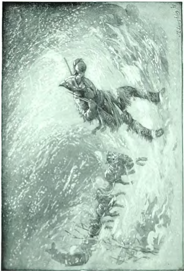
MISSIONARY AND INDIANS IN A BLIZZARD.