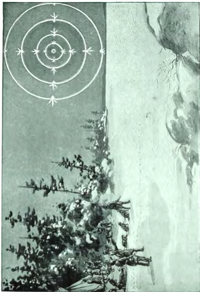
THE MOCK SUNS.