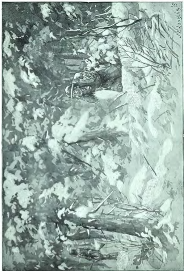
INDIAN WOMAN CARRYING DEER.