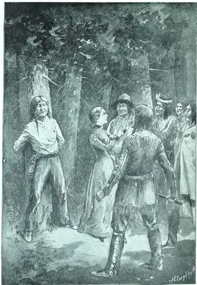
PLEADING FOR THE REPENTANT INDIAN.