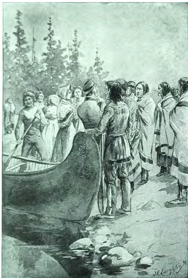
THE FAREWELL PARTING WITH THE INDIANS.