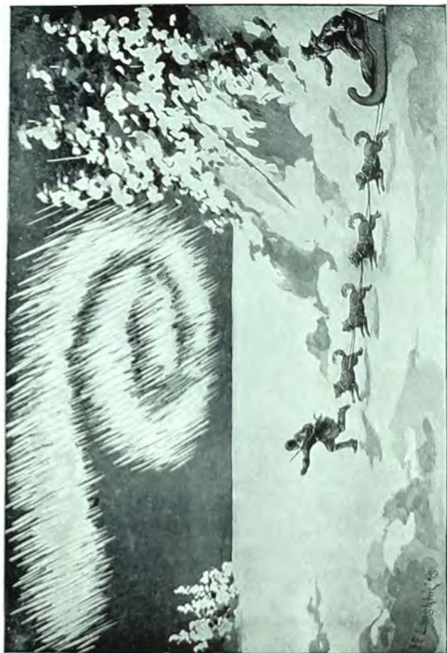
THE WONDROUS AURORA.