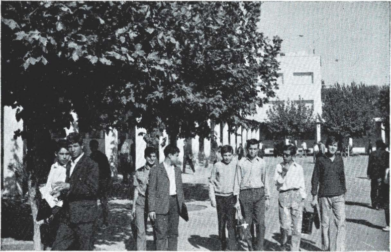
NORTH AFRICAN YOUNGER GENERATION

This is a great comfort to us here in Oran. We have already seen many tokens of the Lord's care for His children and we have the assurance that His eyes will always be upon them.