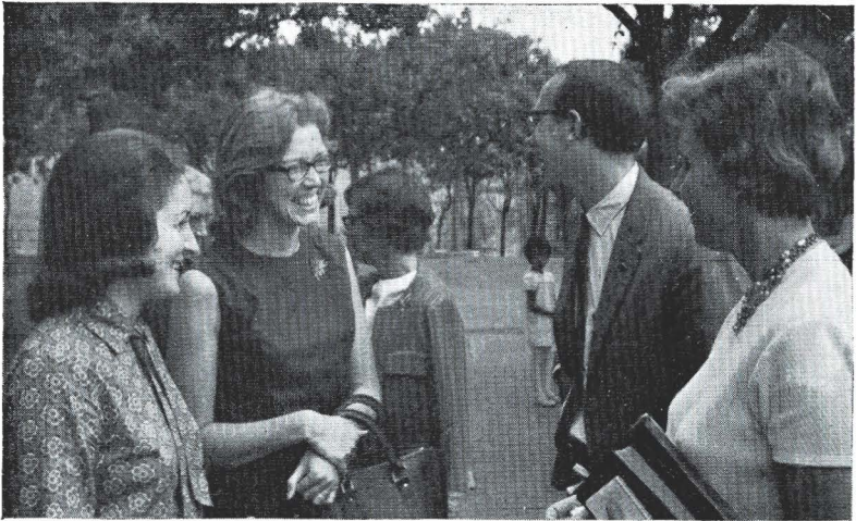
INFORMAL GROUP OF MISSIONARIES

"Jesus answered and said unto her, ' . . . whosoever drinketh of the water that I shall give him shall never thirst; but the water that I shall give him shall be in him a well of water springing up into everlasting life.' The woman saith unto him, ' Sir, give me this water, . . . ' "