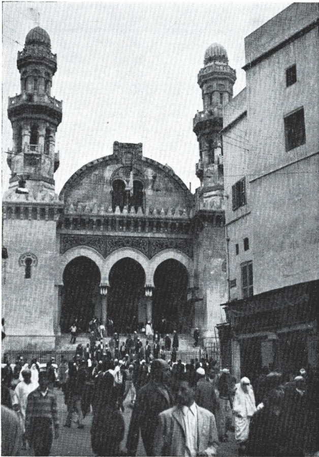
MUSLIM WORSHIPPERS LEAVING A MOSQUE