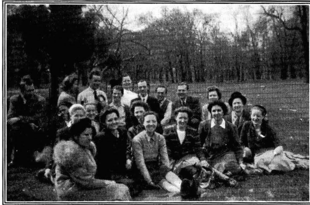
A PICNIC IN THE BOIS DE VINCENNES Missionary Students in Paris for Language Training

Life here is very full indeed. We are in Paris with no easy task before us—to learn the