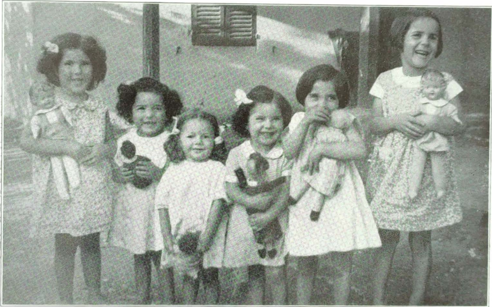
The Little Family at Mekla

A FEW years ago the Misses Fearnley (then at Djemâa Sahridj) sent out a touching little photographic folder showing some of the "unwanted" babies for whom they