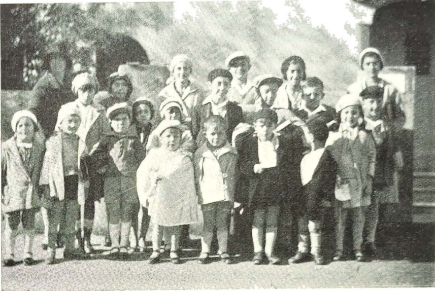
Children of the Italian Sunday School, Casablanca.