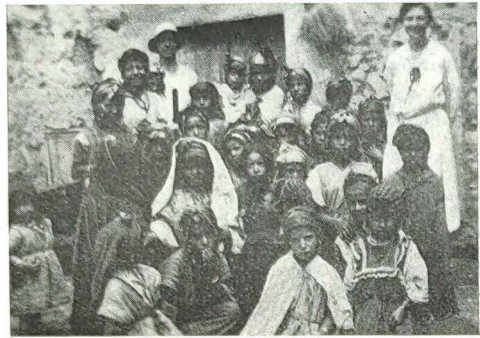
A Girls' Class at Tebessa.