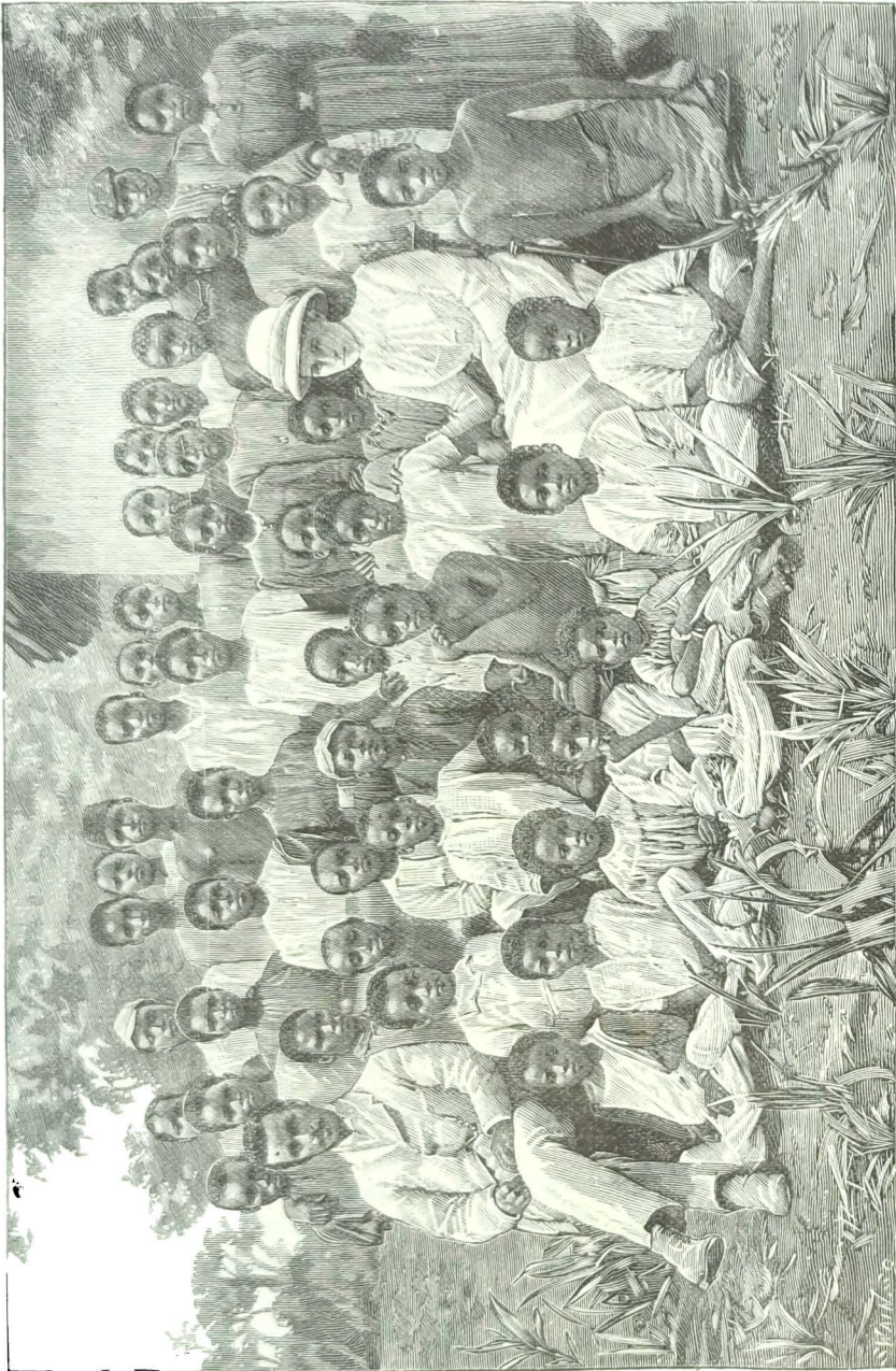
BOOBO NATIVE SCHOLARS.—(From a Photograph.)