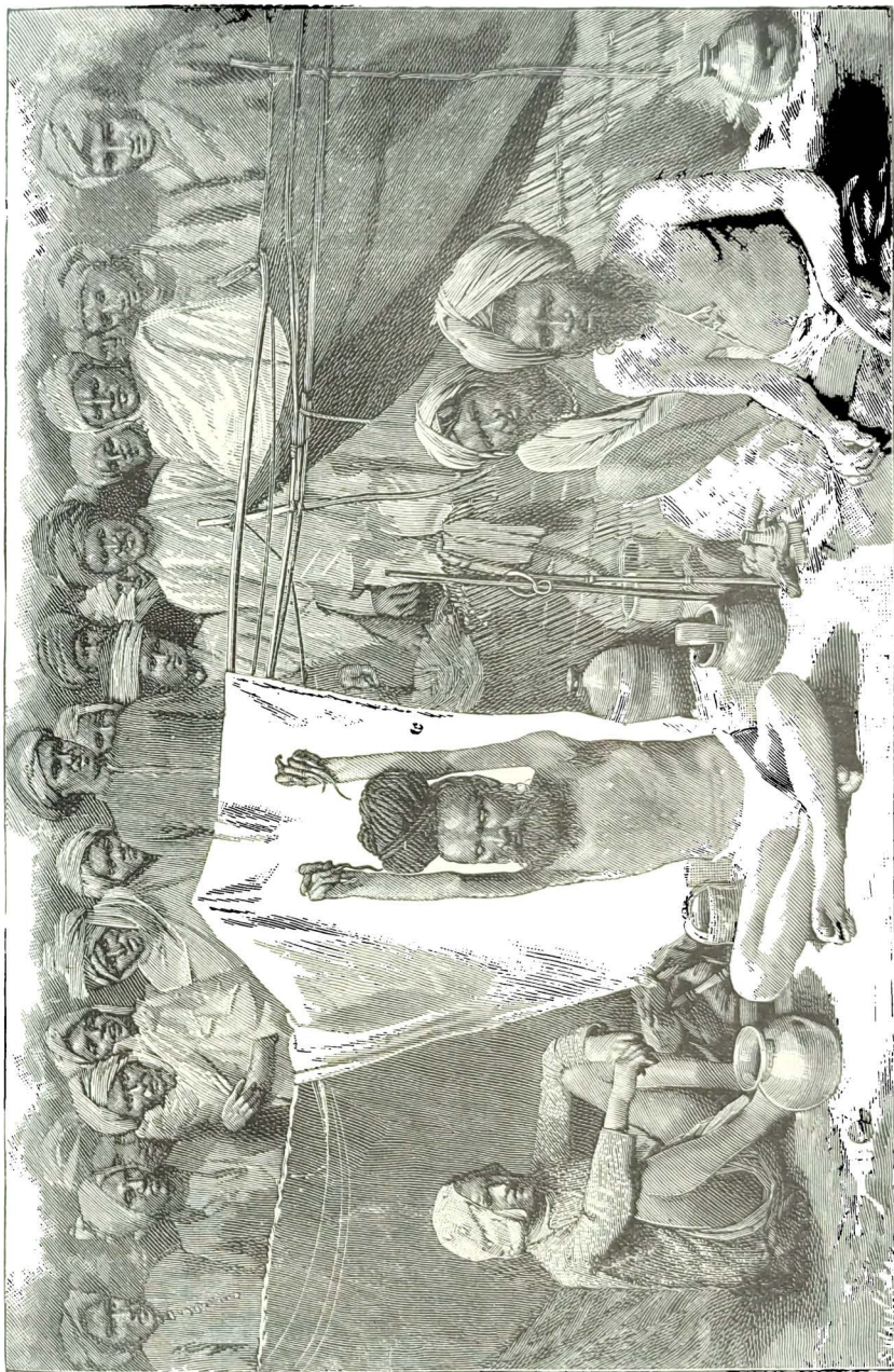
A HINDOO ASCETIC.—(From a Photograph.)