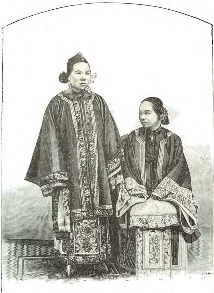
TWO CHINESE LADIES.—( From a Photograph. )

extremely pleasant, but I found very little the matter with her from a medical point of view. After talking a while with her, and drinking the