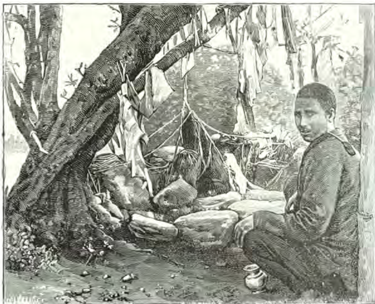
INDIAN STONE GODS.—(From a Photograph.)

standing on a raised altar of brickwork. Such sights forcibly remind us of what the prophets of old saw in Israel, and which roused their righteous indignation, when the people left the service of Jehovah and worshipped gods of wood and stone "upon every high hill and under every green tree." This passage from Sacred Writ accurately describes what may be seen in India to-day far and wide. In Bengal, where there are no hills, almost every banyan or pekul tree of any size is used in this way. But in other parts of India, where there are hills, their summits are often sacred to idols. This picture was taken on a hill-top in the station of Darjeeling.