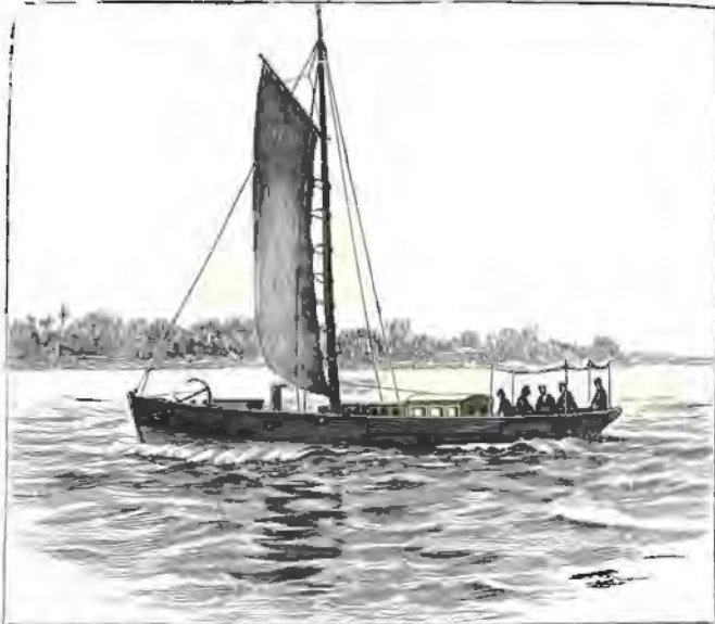
THE NEW STEEL LIGHTER, “PLYMOUTH,” ON THE CONGO RIVER. (From a Photograph.)

READERS of the HERALD are doubtless acquainted with the name of the Congo Mission Boat Plymouth , which has done such good service for many years past, but which now, by reason of constant use, has become worn out.