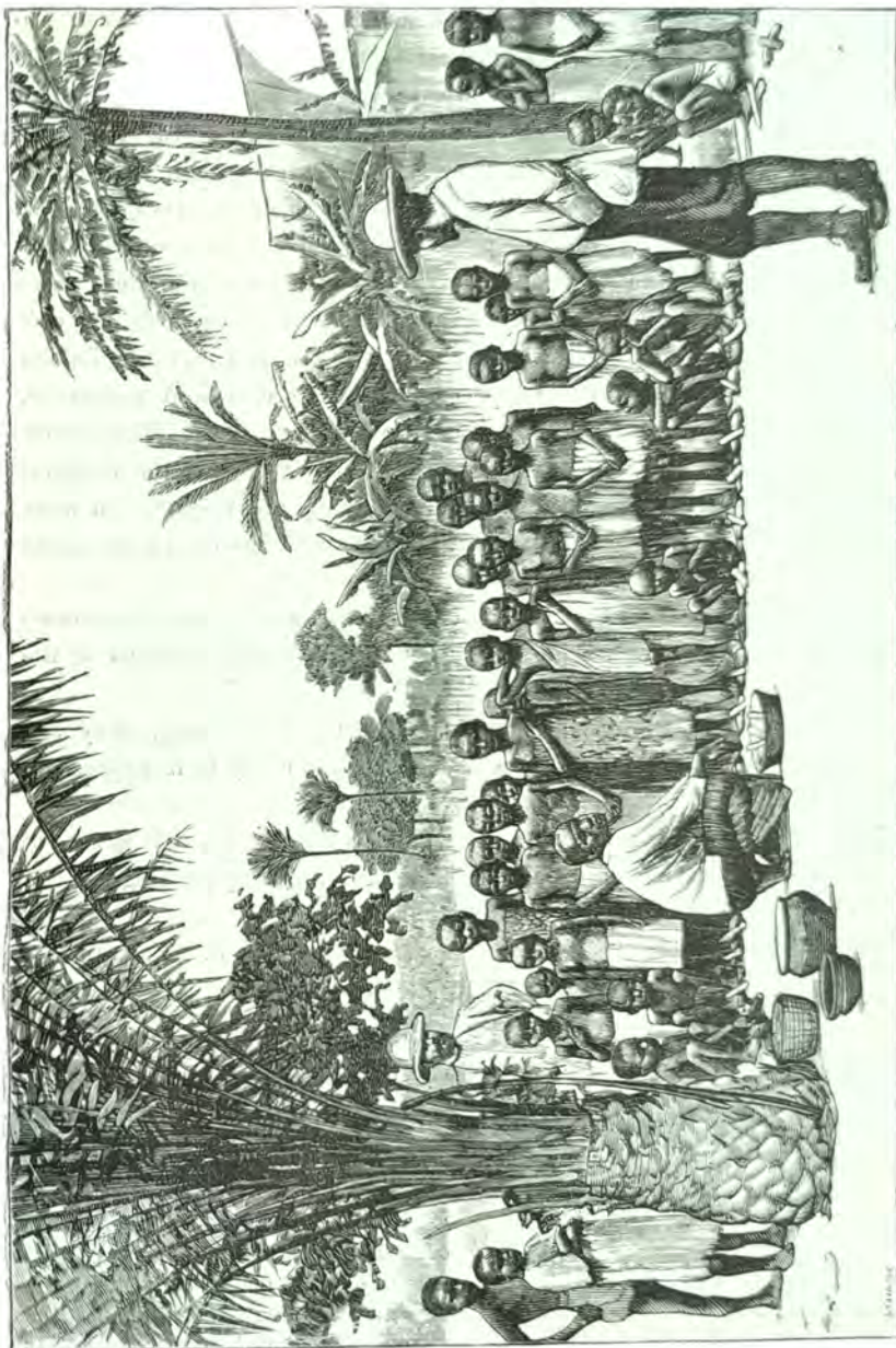
CHOP-TIME, BANGALA.—(From a Photograph.)