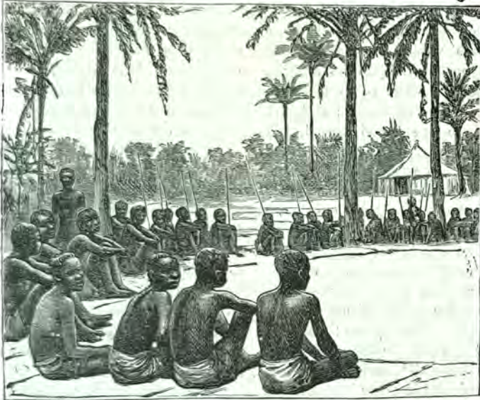
BOLOBO CHIEFS ASSEMBLED FOR PALAVER.—(From a Photograph.)