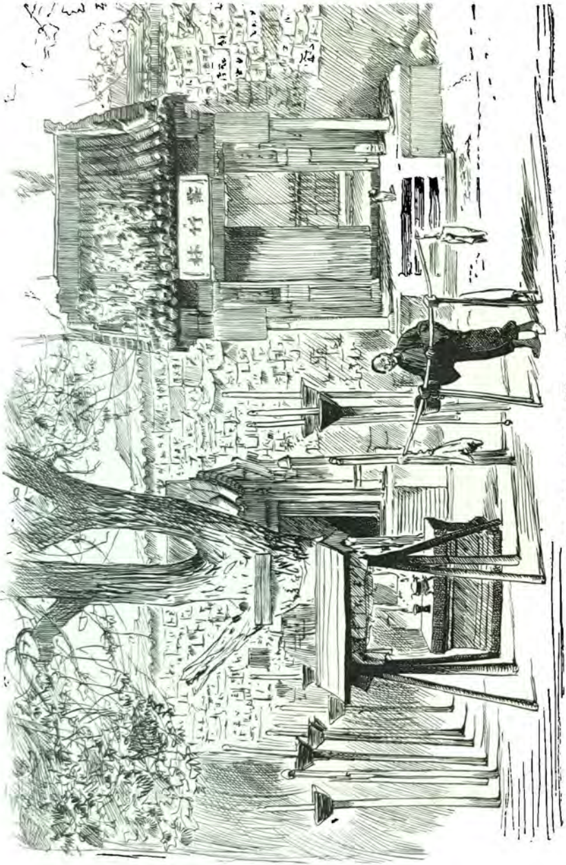
TZU CHU LIN TEMPLE.—(From a Photograph.)