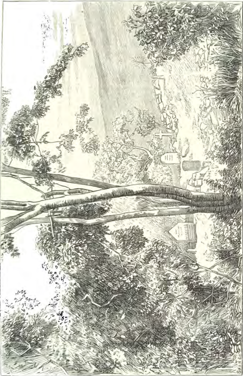
MISSION BURIAL GROUND, AT UNDERHILL, CONGO RIVER.