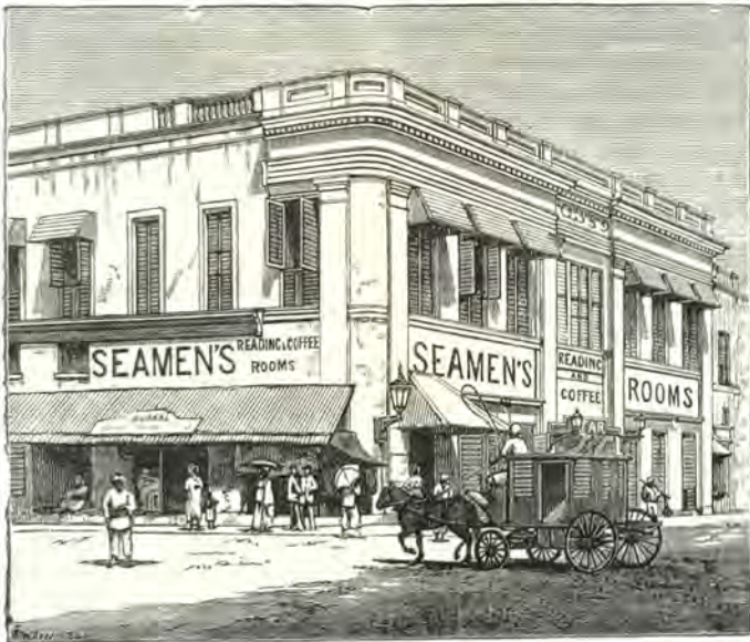
SEAMEN'S COFFEE ROOMS, CALCUTTA.—(From a Photograph.)

M ISSIONARIES go to India specially to preach to the heathen; yet they do not neglect their own countrymen. The Serampore missionaries had not been long at work before they commenced preaching in English in Calcutta to the soldiers, sailors, and European or Eurasian residents. This led to the building, in 1809, of Lal Bazar Chapel, in the centre of the city, in the street most frequented by the sailors, and the Gospel has been preached there ever since. Other Christian bodies have followed in this work, and hundreds and thousands of nominal Christians have been led to real faith in Christ through the labours of missionaries and their wives. During the last few years, the work in Calcutta among the seamen has been carried on with special vigour by the American Methodists, in connection with that branch of their operations which was started some