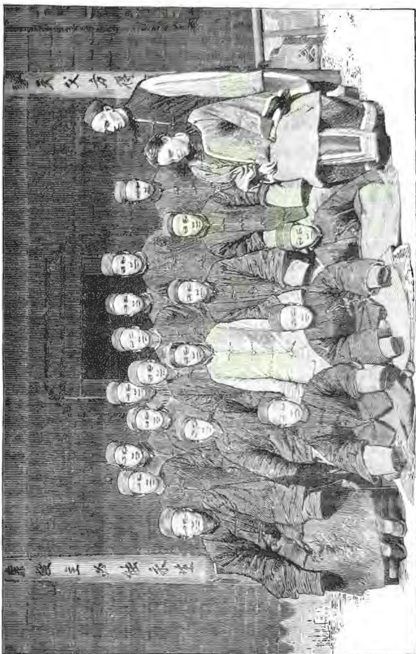
MISSION SCHOOL, TSI'NG CHIEU KU, SHANTUNG.—(From a Photograph.)