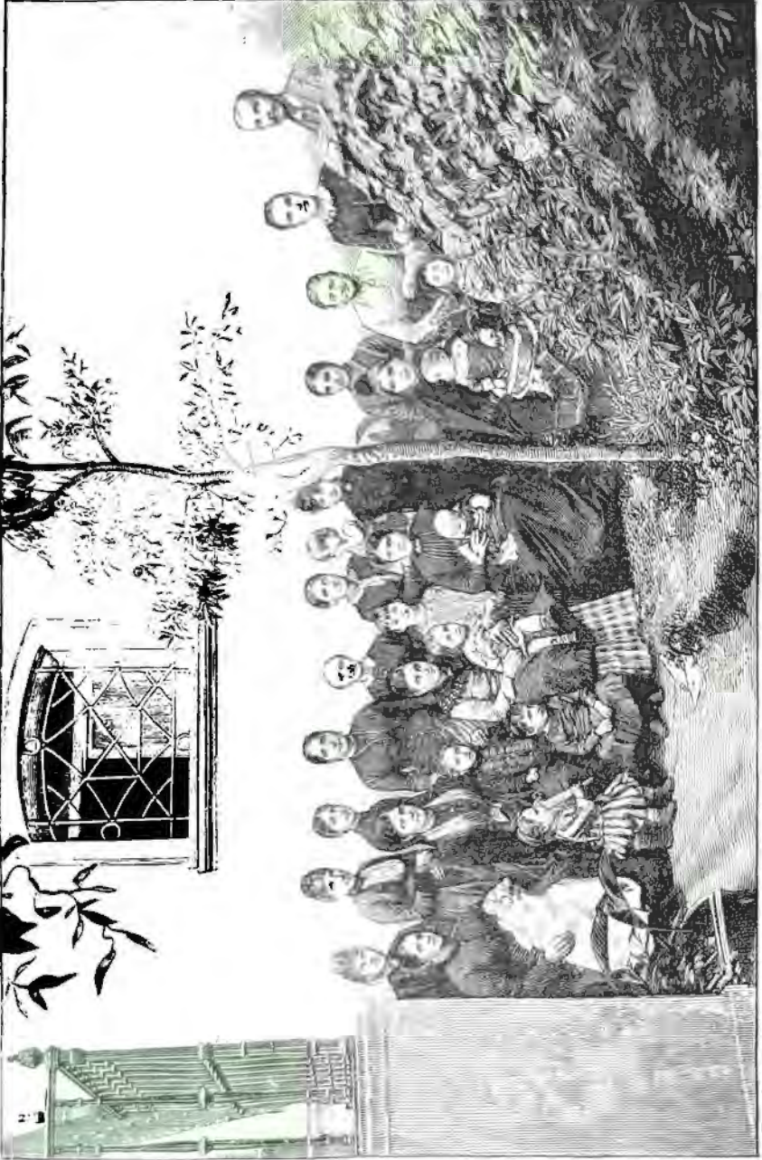
THE ITALIAN MOTHERS' MEETING IN NAPLES.—(From a Photograph.)