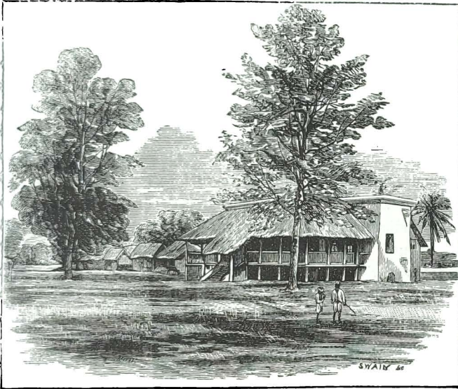
THE SMALL MISSION HOUSE, BARISAUL.—(From a Photograph.)