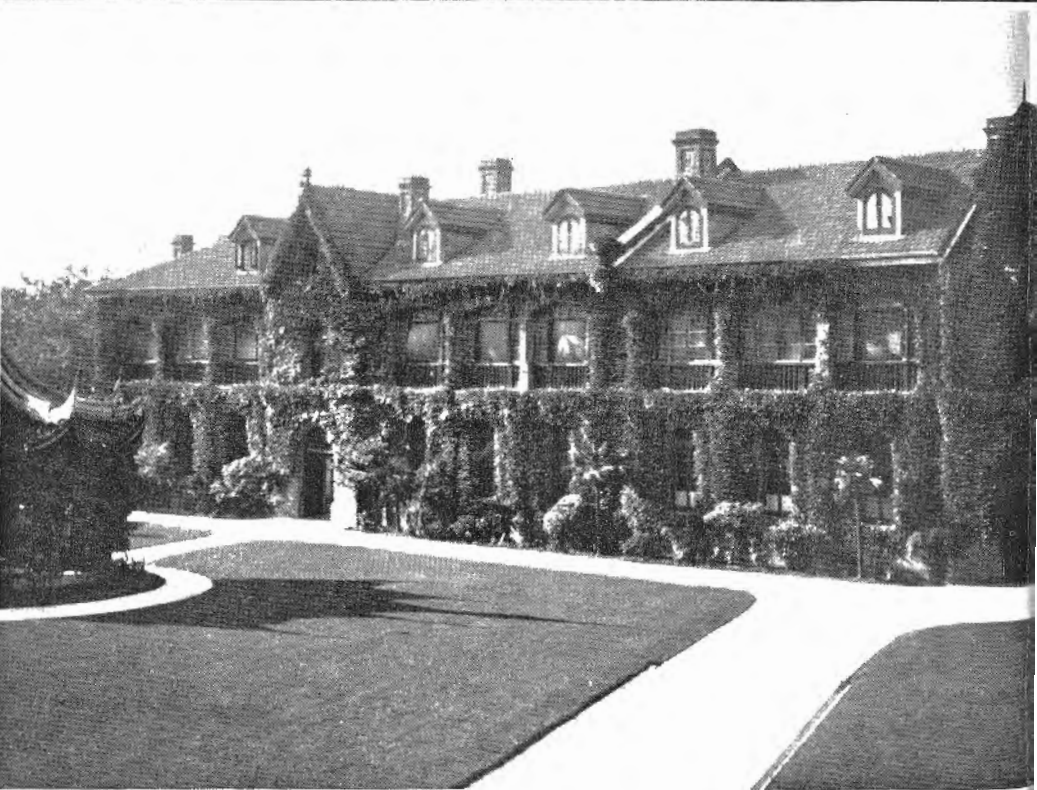
The Mission headquarters in Shanghai. Upper: The present Home building at Sinza Road Lower: One side of the quadrangle at Woosung Road, the Mission Centre from 1890 to 1931