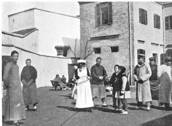
A GROUP OF PATIENTS, WITH MATRON AND HEAD ASSISTANT.