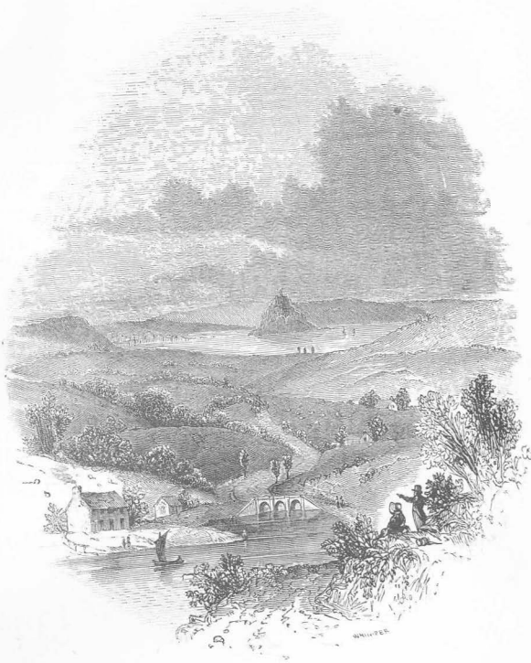
VIEW NEAR MARAZION.