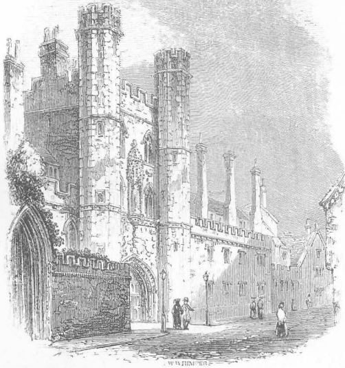
ST. JOHN'S COLLEGE, CAMBRIDGE.