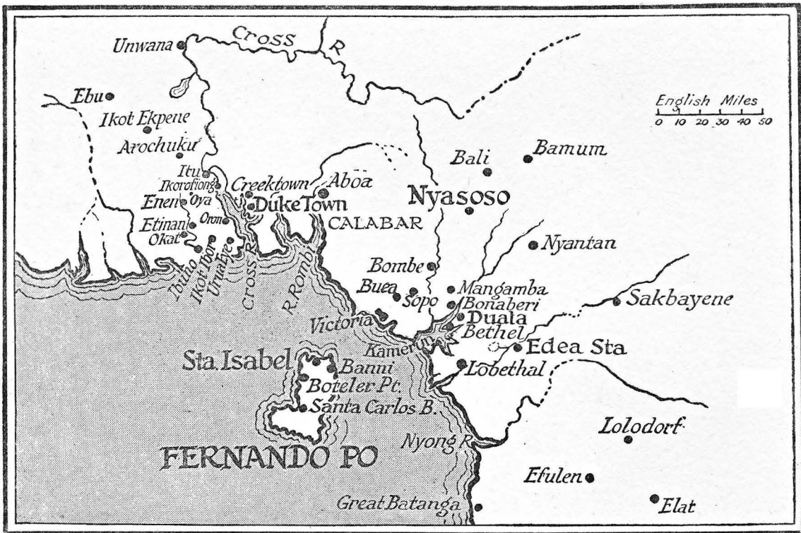
FERNANDO PO AND THE CAMEROONS, SHOWING THE STATIONS OF THE NATIVE CHURCH IN 1922.