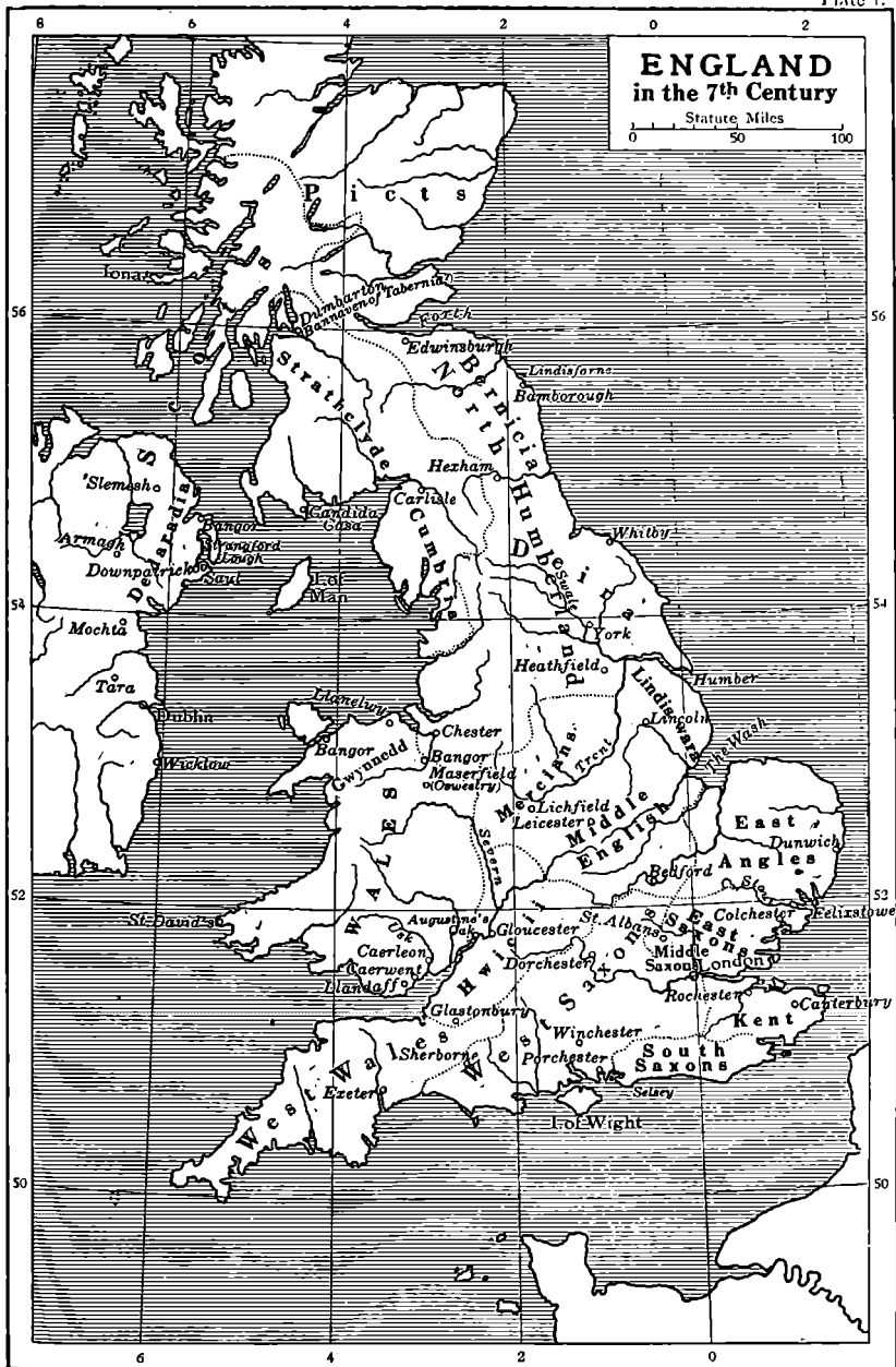
Longmans, Green & Co., London, New York, Bombay, Calcutta & Madras. George Philip & Son, Ltd.