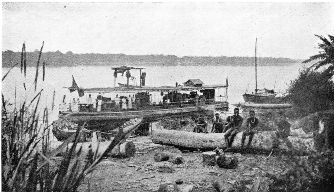
S.S. PEACE :

Pioneer steamer on the Congo, designed, re-assembled and directed by George Grenfell, 1884—1906