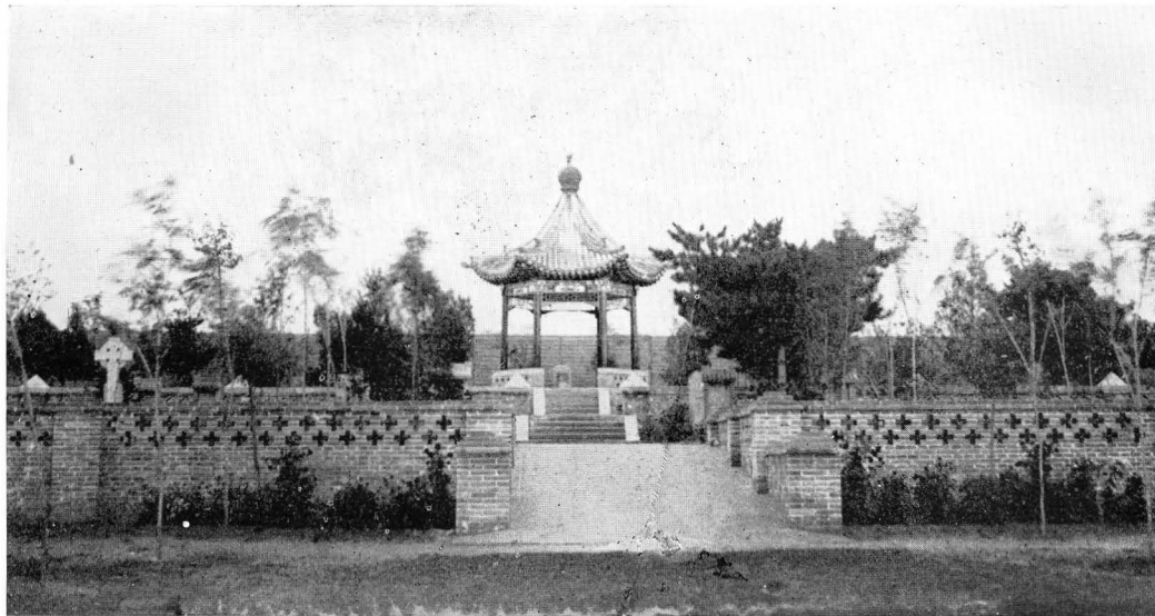
MEMORIAL IN TAIYUANFU, SHANSI, CHINA to our missionaries who were killed in the Boxer Rising, July, 1900