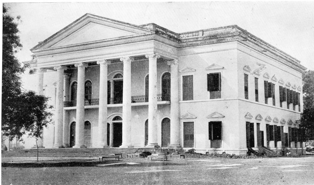
SERAMPORE COLLEGE, INDIA founded by William Carey in 1818