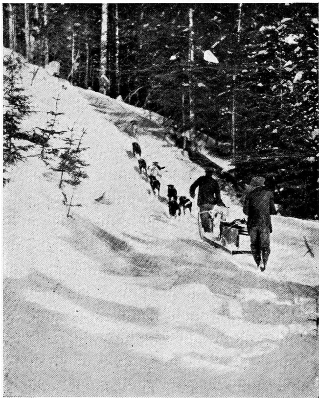
GOING THROUGH A BIG DROGUE