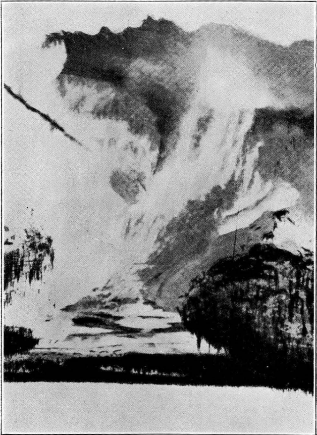
THE BIG FALLS IN WINTER