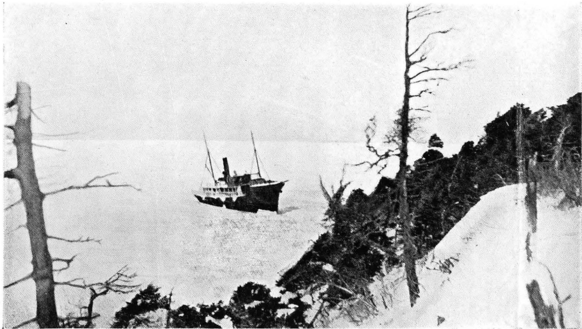
THE WRECK OF THE MAIL STEAMER