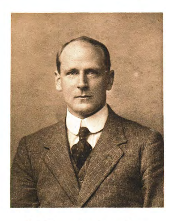
It Stanly Jen Pins