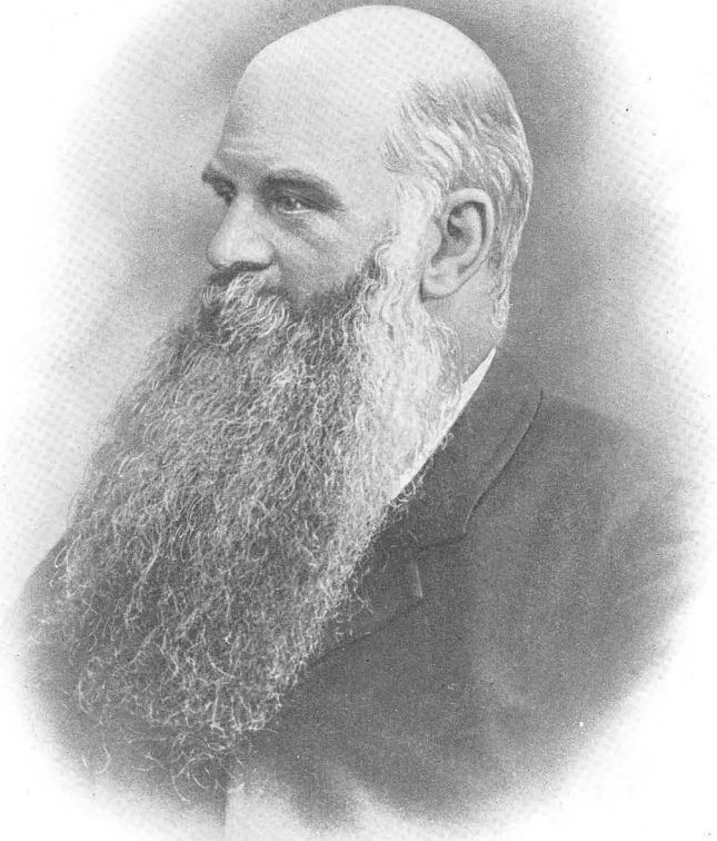
THE RIGHT HON. SIR JOHN H. KENNAWAY, Bart., C.B., M.P., President of the Society.