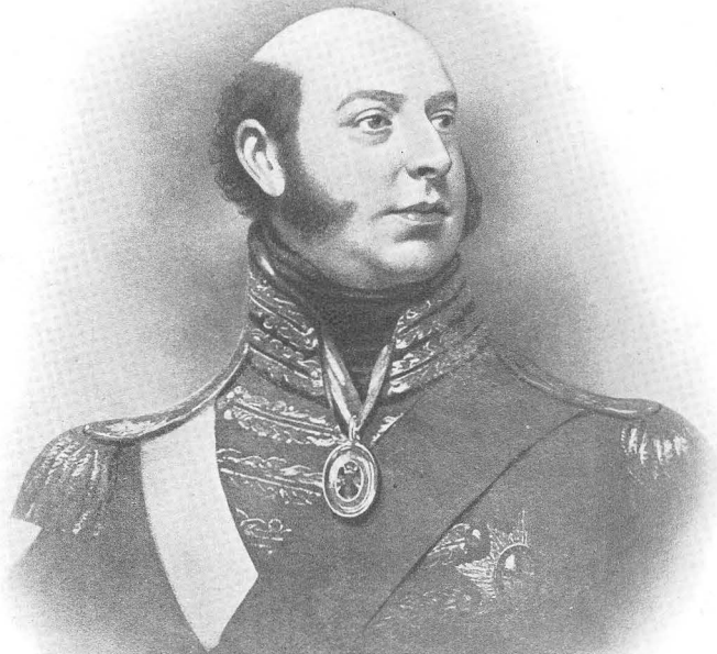
H.R.H. THE DUKE OF KENT.