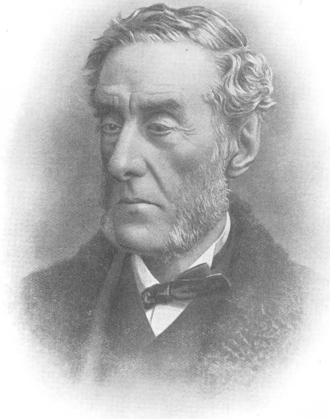
THE EARL OF SHAFTESBURY, K.G., President, 1848—1885.