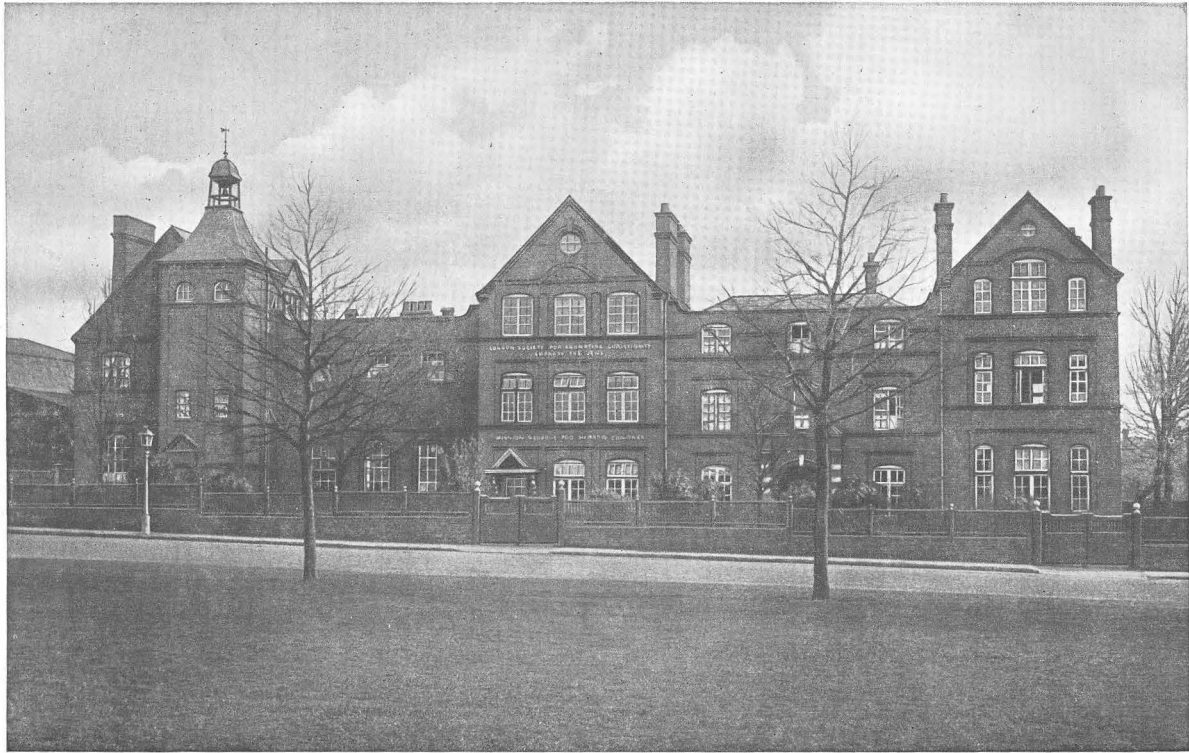
MISSION SCHOOLS, STREATHAM COMMON.