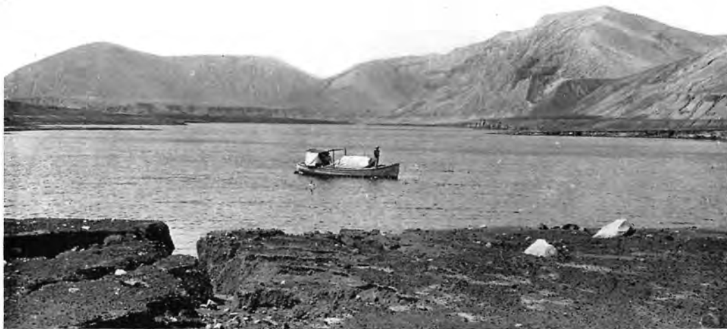
LAUNCH AT ANCHOR IN TWELVE FATHOMS OF WATER OVER THE SITE OF HOSPITAL.