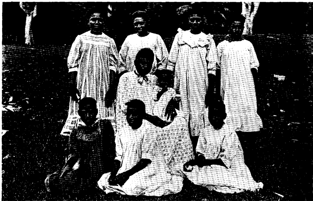
CHRISTIAN WOMEN OF EPI AND PAAMA.