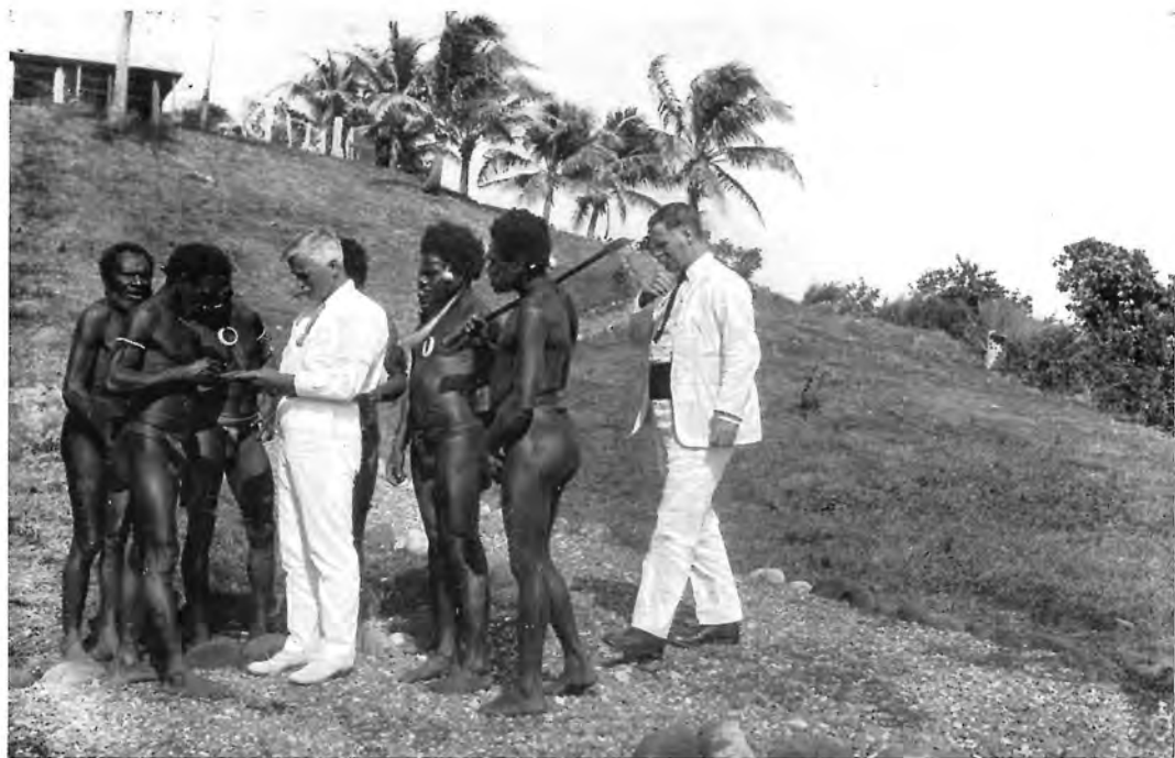
NATIVES ADMIRING PHOTOGRAPHS OF THEMSELVES.