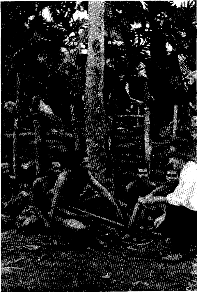
THE AUTHOR ON TOUR AMONG THE VILLAGES OF AMBRIM.