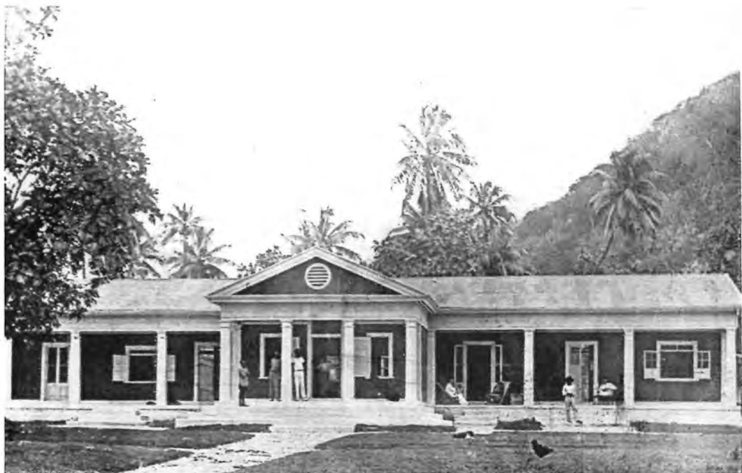
AMBRIM HOSPITAL. DESTROYED BY VOLCANIC ERUPTION.