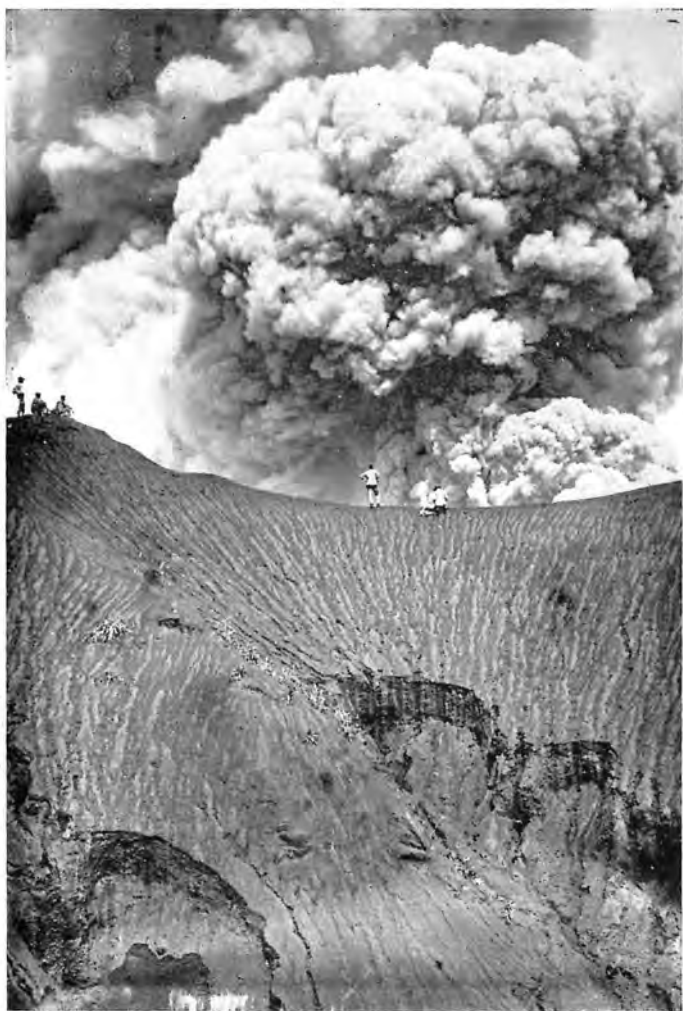
MOUNT BENBOW IN ERUPTION.

CAPTAIN AND OFFICERS OF H.M.S. SEALARK AT EDGE OF CRATER.