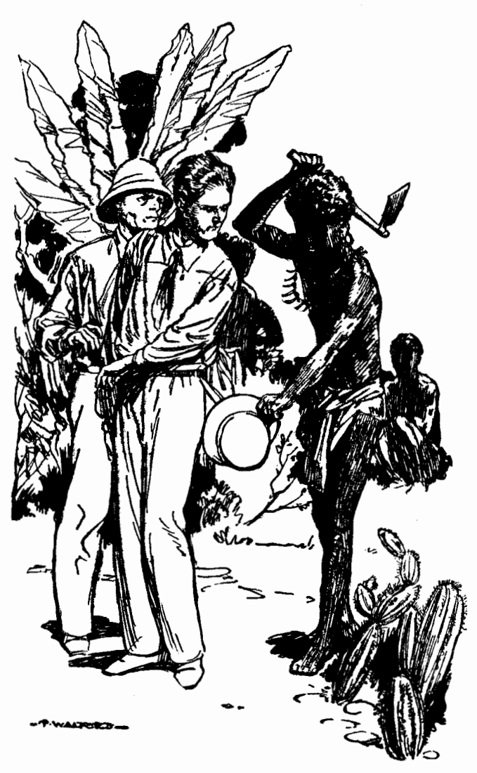
THERE WAS NO OCCASION TO BE AFRAID.

The Chief cast envious eyes upon the hat, and Coley told him he might have it, which he promptly proceeded to do by cutting it from its fastening with his newly acquired adze.