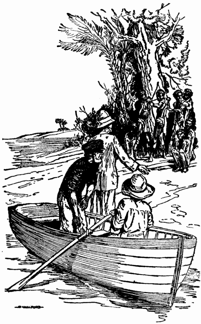
A MOMENT OF PERIL.

As he leapt ashore a man raised his bow and drew it, pointing the arrow straight at him, lowered it, then raised it again, but at last dropped it altogether.