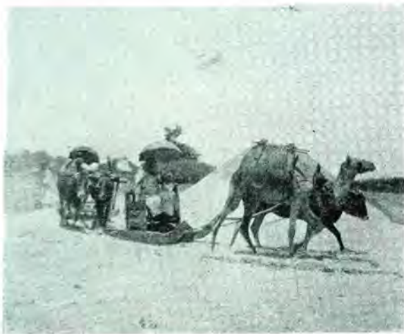
Camel used for threshing, "unequally yoked."

We cannot admire his character, although he is so useful. But he really cannot help himself, as he is only a beast. What about the boys and girls who are so clever and capable, and yet spoil their service by their bad temper? They have no excuse for we have a Saviour who can save to the uttermost, and who is more than willing to break the power of sin in our lives if only we will ask Him to do so.