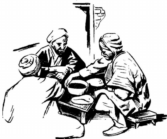
Egyptians “enjoying a meal” in the same way.

On the port side, you would have seen a group of Muslims from Pakistan sitting in a circle. Enjoying the meal along