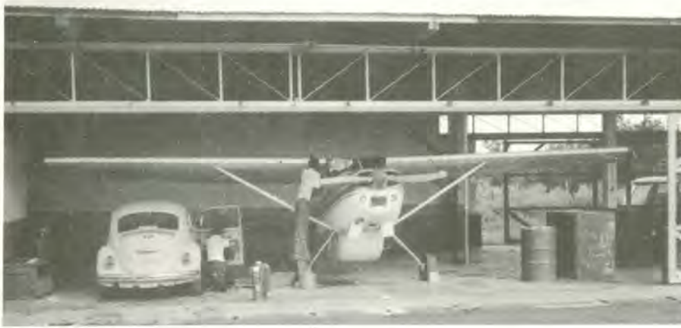
MAF plane being prepared

August and January. In Britain we experience very different weather conditions during these two months. In Zaire, too, it is a similar story. My first visit took place in August 1966 and memories of the occasion, kept alive by coloured slides, include dry dusty roads, brown grass and controlled burning which at night was a sight to behold. I chose to make my second visit ten years later during December and January. I chose that time so that I would be able to share in the Christmas celebrations and also see the countryside when the grass was green and growing fast. I arrived almost too late to see the frangipani and too early for the poinsettia to have turned red, but at just the right time to taste the delights of mangoes and pineapples.