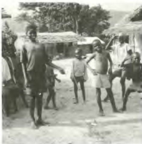
Angolan children at Kimwana

As I think now of the changes that I noticed on my second visit and the progress that had been made during the ten years I must point out first of all that Zaire is a vast country and I was only able to see a tiny part of it. It would be foolish to assume that my impressions applied to the whole country. Nevertheless there were several points of change. Apart from the aviation service already described there were other differences in travel. There was generally much more traffic on the main Kinshasa to Matadi road, with cars and buses as well as the lorries I had seen in '66. Usually the buses were packed full to overflowing with passengers and their belongings. Then there were more goods in the shops, but these were also more costly. Kinshasa has its large stores but the ordinary everyday requirements like margarine were often in short supply. Bread prices had doubled since I was first there. Petrol had gone up alarmingly, so had oil