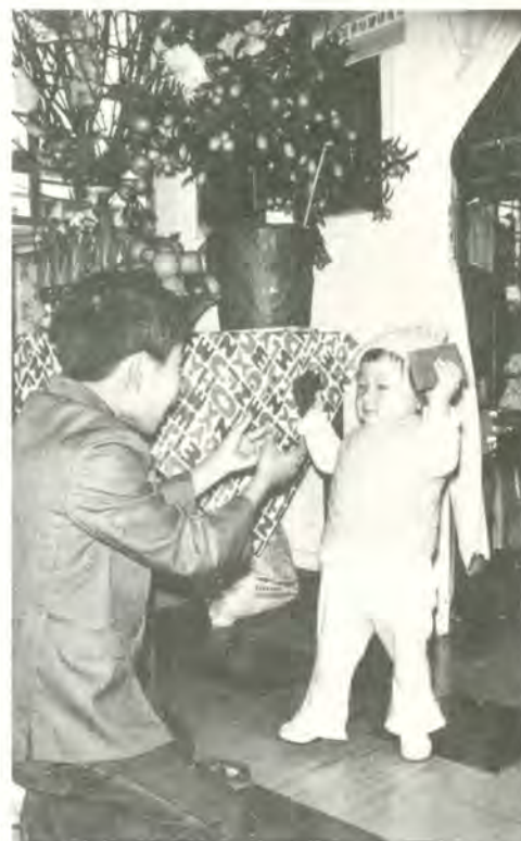
A baby holds a packet of lucky money

Chinese Christians have a hard time financially because they have to celebrate both festivals in the traditionally accepted way at great expense to themselves. If only we could lay tradition aside and concentrate on the true significance of the Christmas festival! For the Christian of any nationality