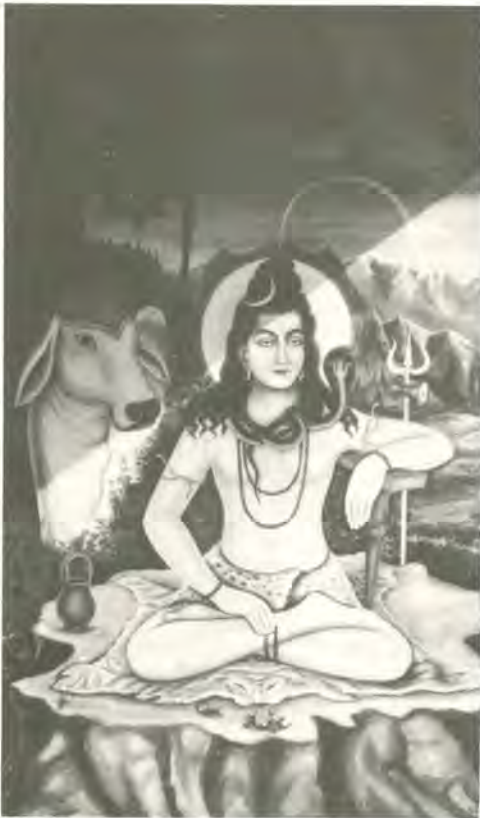
The god Shiva

The first Sunday in Advent marks the beginning of the year in the Christian calendar. The Advent season prepares the mind for the celebration of the coming of the Christ child, and to this end culminates in Christmas. On 6 January, Twelfth Night, comes Epiphany, the manifestation of Christ to the Gentiles, which commemorates how the Wise Men brought their treasures to worship the new born King.