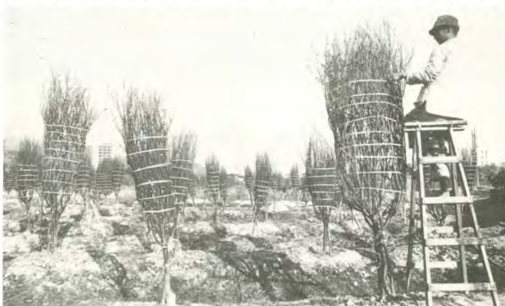
Preparing the peach trees for market