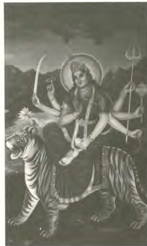
The goddess Durga