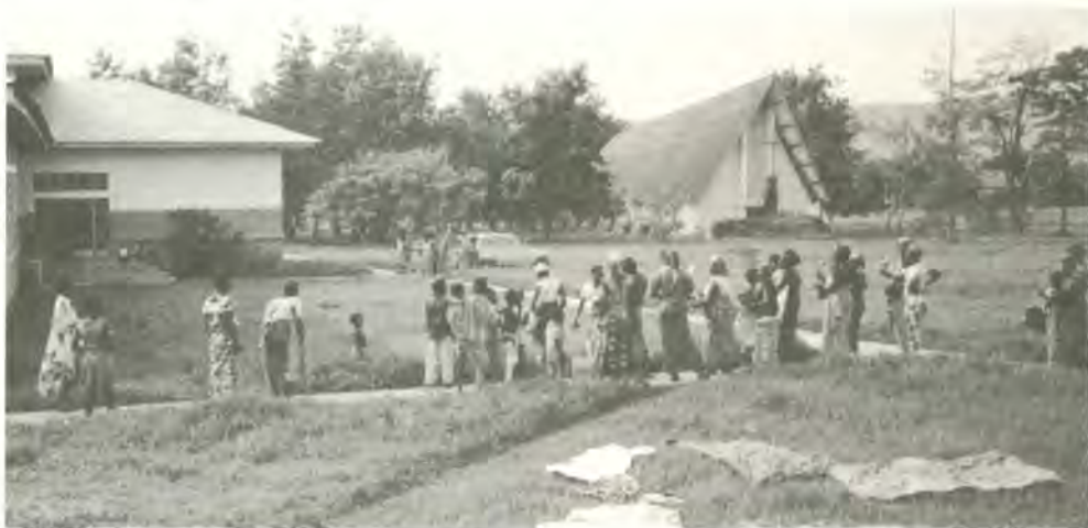
Waiting for Christmas parcels to take to the wards