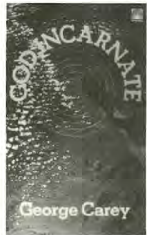
God Incarnate by George Carey Published: Inter Varsity Press 60p

Recently a book called The Myth of God Incarnate was launched with a lot of advance publicity claiming that it was a breakthrough in Christian thinking and the media presented it as a challenge to the traditional belief in the divinity of Christ. It was not to be wondered at, then, that others would feel led to re-state the traditional point of view and support it. This booklet has been offered as a contribution to the debate. It is written by a Durham vicar who has served on the staff of two theological colleges, one in London and the other in Nottingham.