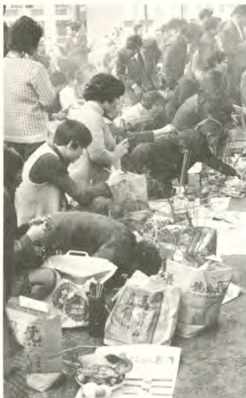
Food, joss sticks and prayers offered for spirits of ancestors

Of the five major Chinese festivals celebrated in Hong Kong, New Year is the most important. Held according to the lunar calendar, it can occur any time between late January and mid February. For many people this is the only time they close their businesses and take a holiday. And it is quite a holiday, officially lasting two full weeks, during which various public entertainments are enjoyed, including Chinese opera, lion dances, variety shows, fun fairs and the like.