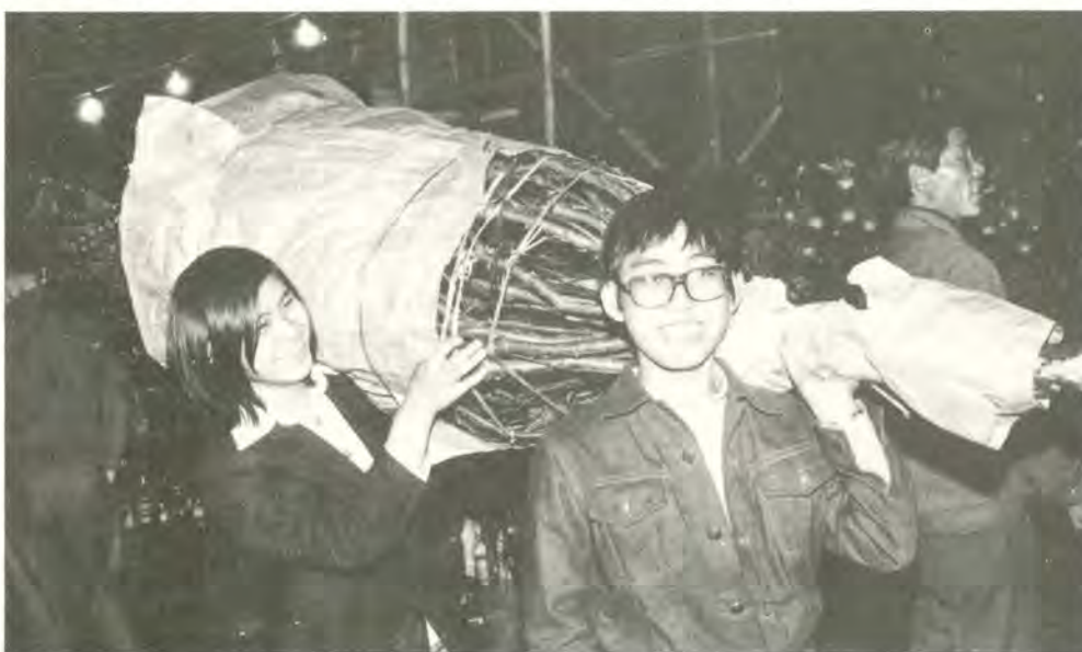
Bringing home the peach tree

Preparations for the New Year festivities