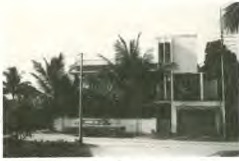
College of Christian Theology, Bangladesh