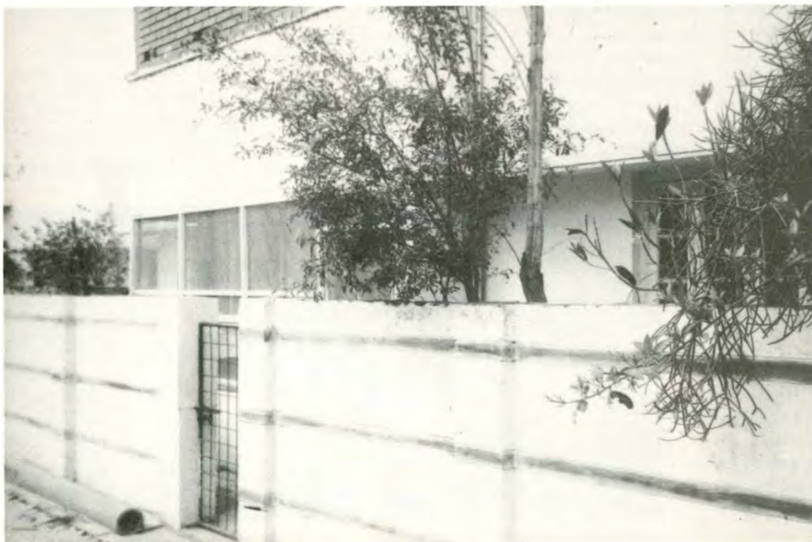
New Christian Centre for the blind in Dacca

Braille printing and in the reading room. Several sighted girls have been requesting classes so that they can learn Braille and there are many blind young women in the city who would attend day classes if we arranged them. The opportunities are endless; we just need the personnel and the time to train them to teach others!