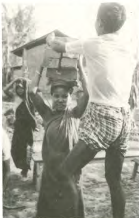
The women help with the building of the clinic

We have appointed a new pastor to care for the three Bengali village churches in our Dacca Baptist Union. These are all small churches and very far apart, entailing much travelling and battling on trains and buses to reach them but they are, none the less, important centres of Christian witness in their locality. One or two keen young men in two of the churches are greatly involved in outreach among their neighbours and one church has already decided to hold adult literacy classes nightly in their church.