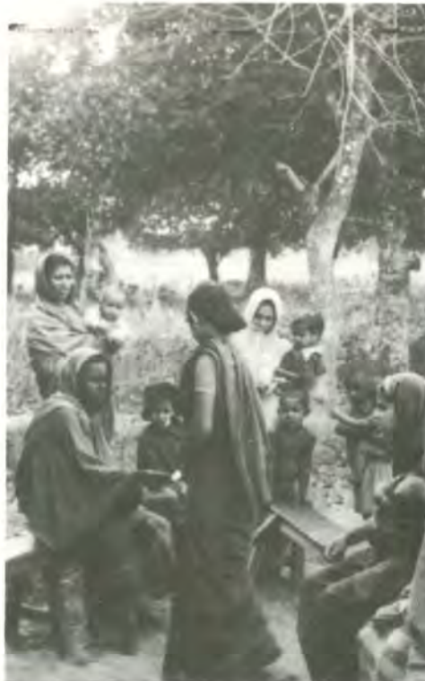
Patients at the Malikbari Clinic