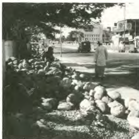
Road making in Dacca

Youth and Sunday School, social concerns, economic development, and family planning. All of these are aimed at service in the name of Christ and to the building up of the church.