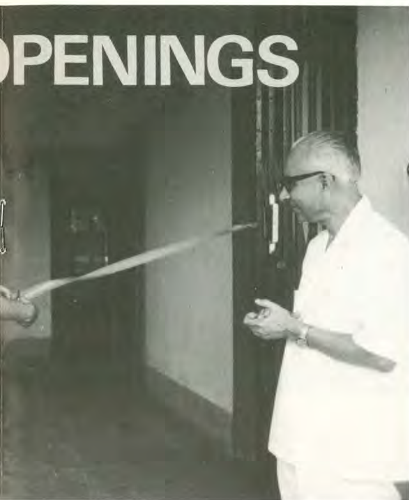
Opening the Blind School

when they reach the age of 12. We are fortunate that the National Society for the Blind are opening a workshop and training centre for adult blind people three-quarters of a mile away from us. This is the first adult training centre in the country and it has been agreed that blind girls and women should also be able to train there. So maybe in a year or two some of our older girls will be learning to weave bandages or make chalk at the centre.