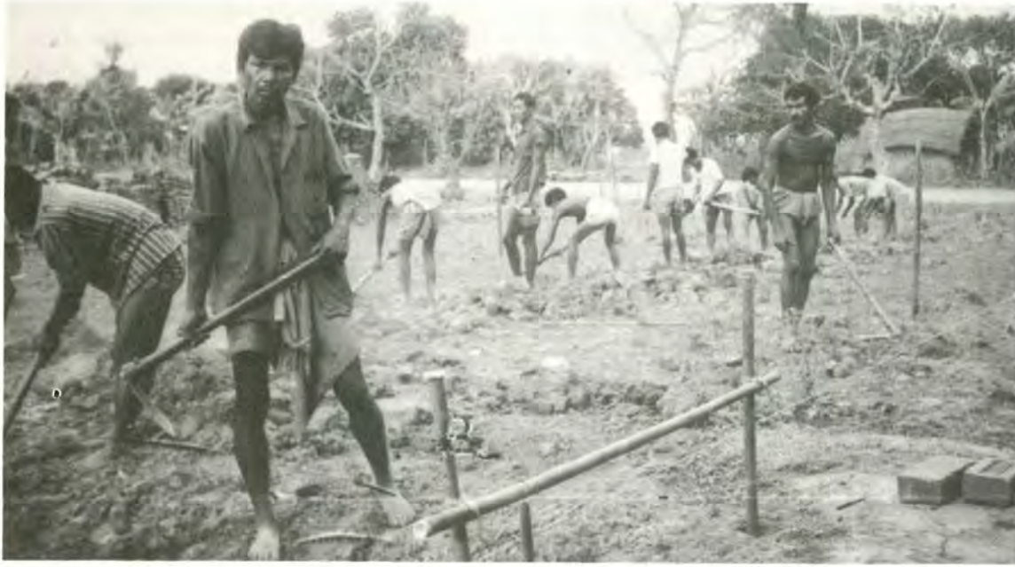
Digging the foundations for the new clinic at Malikbari