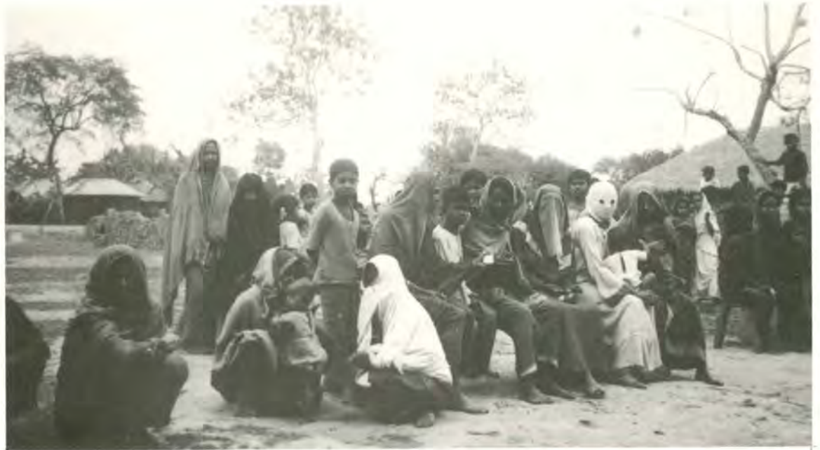
The women and children's clinic at Malikbari

send a team of ten Garo evangelists, men and women, to spend ten days in different centres, teaching and preaching to the churches. In some cases the spiritual level of church life is very low and there are long standing quarrels and divisions among the members, so we look forward to the ministry of these teams for Garo evangelists can best reach Garo people in their own language, even though everyone has Bengali as their second language.