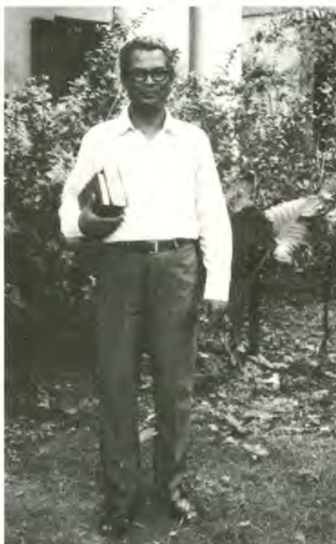
Rajan Baroi, Secretary of Bangladesh Sangha

The National Council of Churches has its headquarters in Dacca. It serves as a meeting place and focal point for many church bodies in Bangladesh and on occasions acts as the mouthpiece on behalf of the Christians in this country. It works in many different areas of the church's life. Women's work,