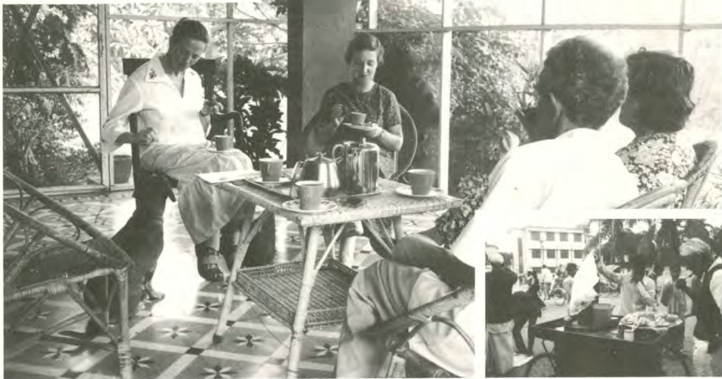
Tea time on the veranda and street scene in Dacca