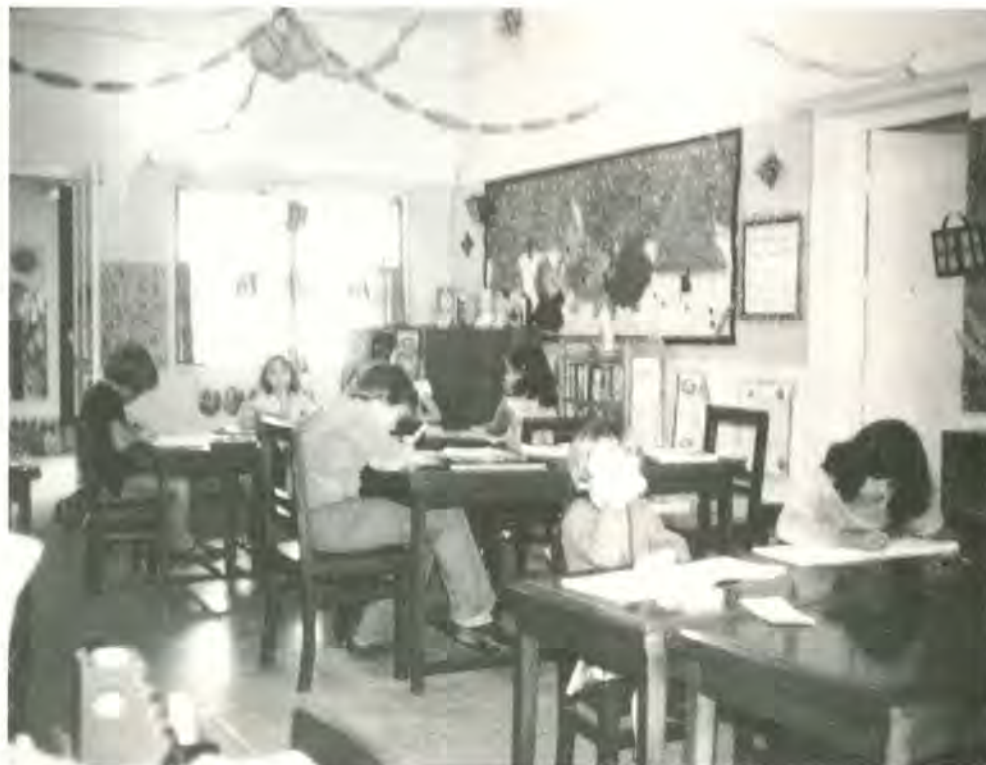
Classroom in Christian Primary Education Centre, Dacca

For all of us who have been involved in establishing the school the last months have been a time of really trusting the Lord to provide all our needs. To equip a school here is not quite as straightforward as it would be in England and yet, from various sources, we have received so much. Nor is it easy for parents to send their children away from home but the Lord has given them a real peace about this and has provided loving 'foster-parents' to care for their children here in Dacca. Please join in prayer with us for parents and children who face this separation, and for the need of hostel parents to provide a permanent home. Pray, too, that the children will all be happy in their school situation as well as receiving a good education, of course!