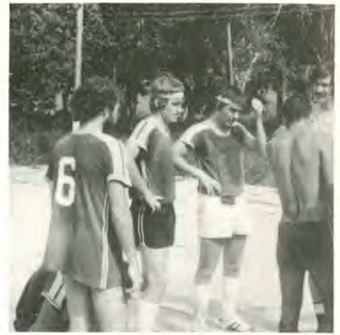
A break for football at the youth conference