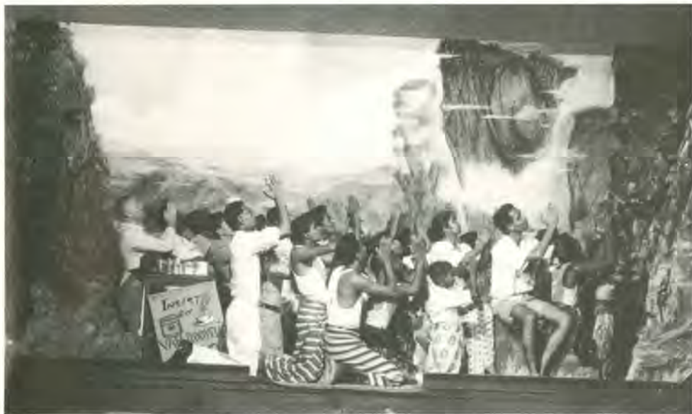
Drama in the Lankan style on the theme of the Atonement, 'Keep us from falling'

In his passing the Society loses a highly talented missionary, who served Christ loyally without counting the cost and was always eager that others should know the Saviour and the salvation available through h:m.