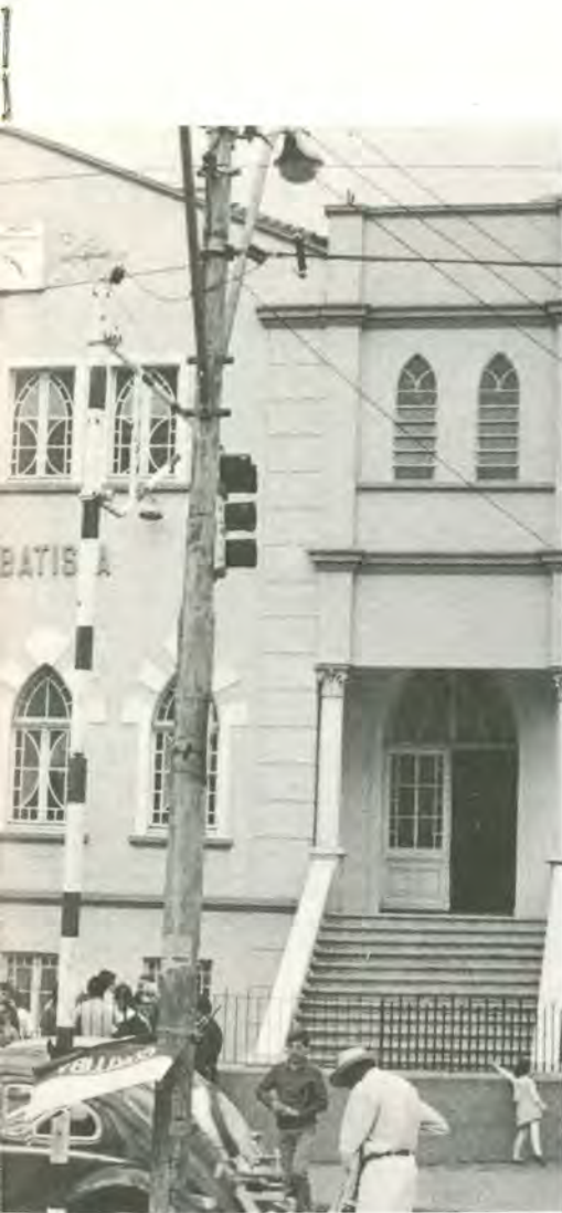
First Baptist Church, Curitiba

He is a quiet, reliable young fellow and his commitment to the Lord can be seen in the dedication he gives to all that he does. We feel he has tremendous potential as a leader, and who knows what the Lord will do through him in these years? Please pray for this young man.