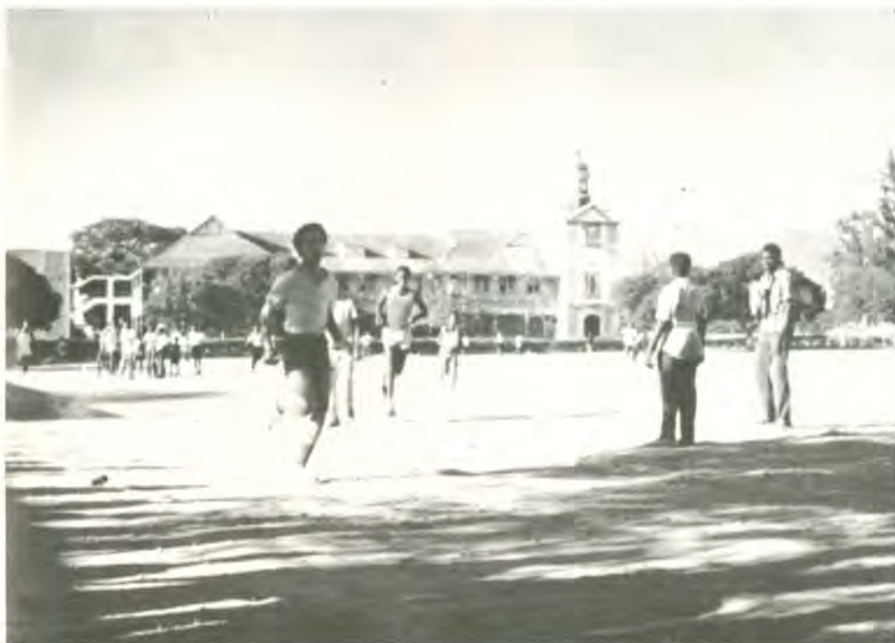
A sports day