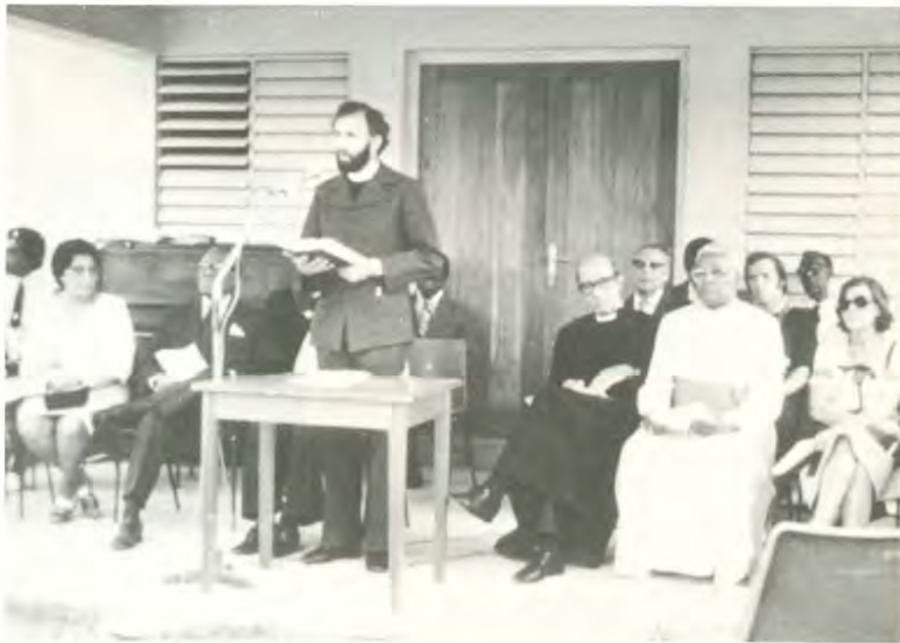
Opening of the Boys' Brigade headquarters

Jamaica is a young country. The greater part of its population is young and this fact is noticeable in every sphere of the country's life. In the professions as well as in business, in offices as well as on farms, in church life as well as in schools where pupils are often not much younger than their teachers. Consequently it is not difficult to understand that there is an ever increasing call for work to be done with and among the young people that the vast potential of this young life may be harnessed for good. The challenge is always there but the problem is a lack of volunteers to answer the call.