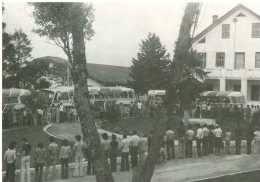
Farewell prayer time

At the time you are reading this we and the young people of Paraná will be involved in two important events. During July two State Congresses are being held, one for the north of Paraná and the other for the south. Then in February 1978 at Porto Alegre there will be a National Congress. These are held every three years and some 2,000 young people are expected to attend next year, including about 100 from Paraná.