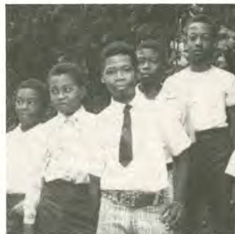
Boys of the Calabar High School

In the realm of football, various competitions are arranged for boys between the ages of nine to 20 and whenever funds can be found efforts are made both to send players overseas and to be host to players from other countries so that the boys can build up international contacts of goodwill. In recent years there has been an exchange visit in which footballers of Calabar High School and Charter House School participated, with good results. Summer camps, too, are always arranged for girls and boys alike. Understandably the youth from the country prefer to camp in the suburbs of the cities and towns while those from the cities and towns look forward to camping in the country. These summer camps usually last for a week to ten days and are staffed by officers of the sponsoring organizations or teachers of the schools arranging the camps. These occasions give a great opportunity for getting alongside the young people in a way not possible at other times.