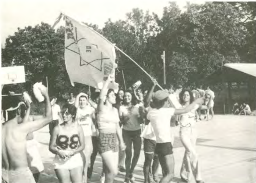
A cheerful group at the conference

by it all, they did eventually manage to sing on their own and then teach the other children a little chorus in English. People noticed how shy they were and at that point we realized that Brazilians seem to have an insight into children and a sympathy with them that we more reserved Britons sometimes lack. We can certainly learn from them in this respect. Perhaps the most moving moment for all of us came on the Wednesday morning, at about eight o'clock. With the coaches waiting nearby and the cars loaded to go, we all linked hands in a circle and sang farewell choruses. It was a fitting end to what had been a very happy occasion.