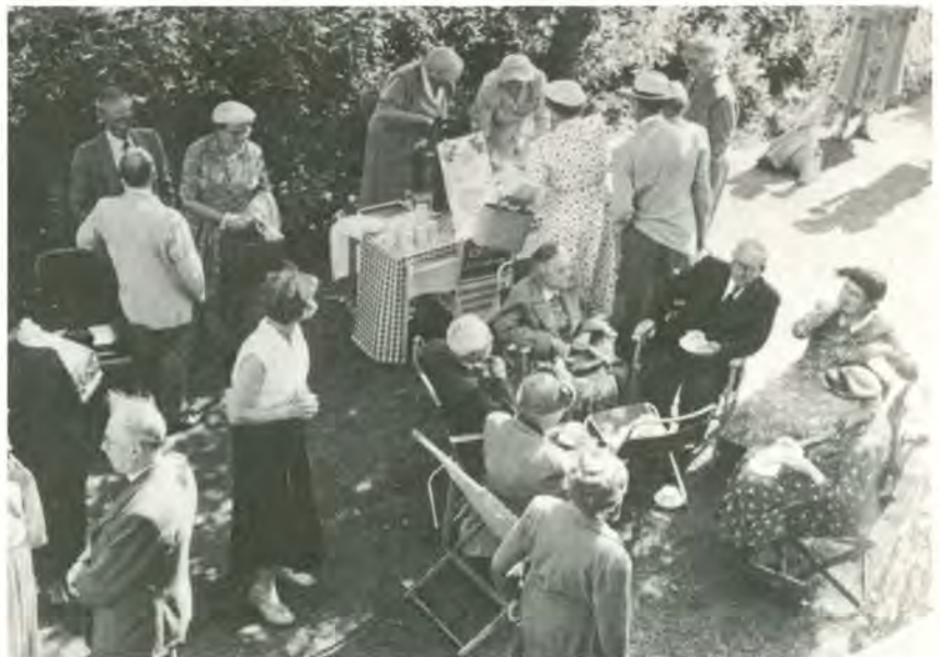
A birthday party celebration at 'South Lodge'

The Baptist churches in Worthing have always shown a keen and helpful interest in South Lodge, organizing garden parties and other