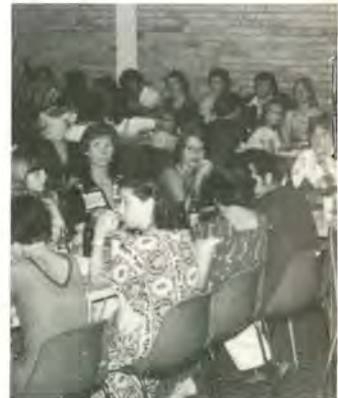
Dining room at the conference