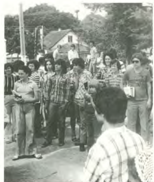
'Banana Break' after morning Bible study