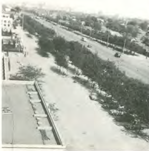
Main East/West Boulevard, Peking

On one occasion, when in a Commune, I had a long talk (with no guide present) to a group of peasants about freedom of thought, of movement, of assembly, and freedom to preach, and asked them, 'Had they not lost these?' They said, 'Yes, but we have gained other freedoms which are precious to us.'