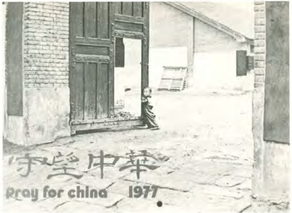
Cover of calendar issued by Asian Outreach

On asking what these were, they answered, 'Freedom from hunger, freedom from famine, from poverty, flood, unemployment, disease, violence, civil war, and social evils.' There is no doubt they certainly had a significance as persons, a security of home, a love of country and an incentive to work which they never had before.