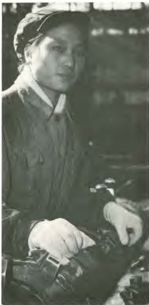
A labour heroine in a steel mill