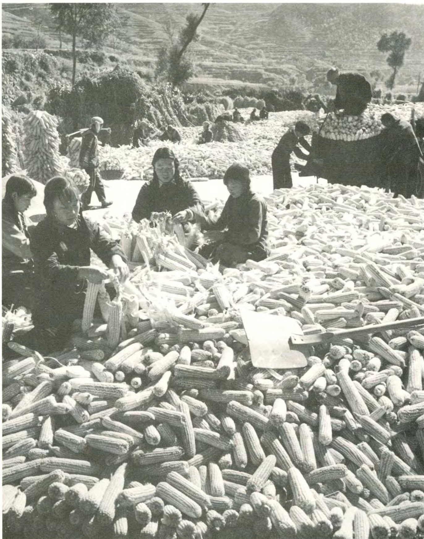
Golden Star People's Commune in Shansi