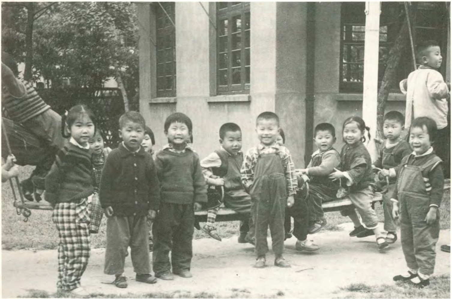
Kindergarten in Shanghai