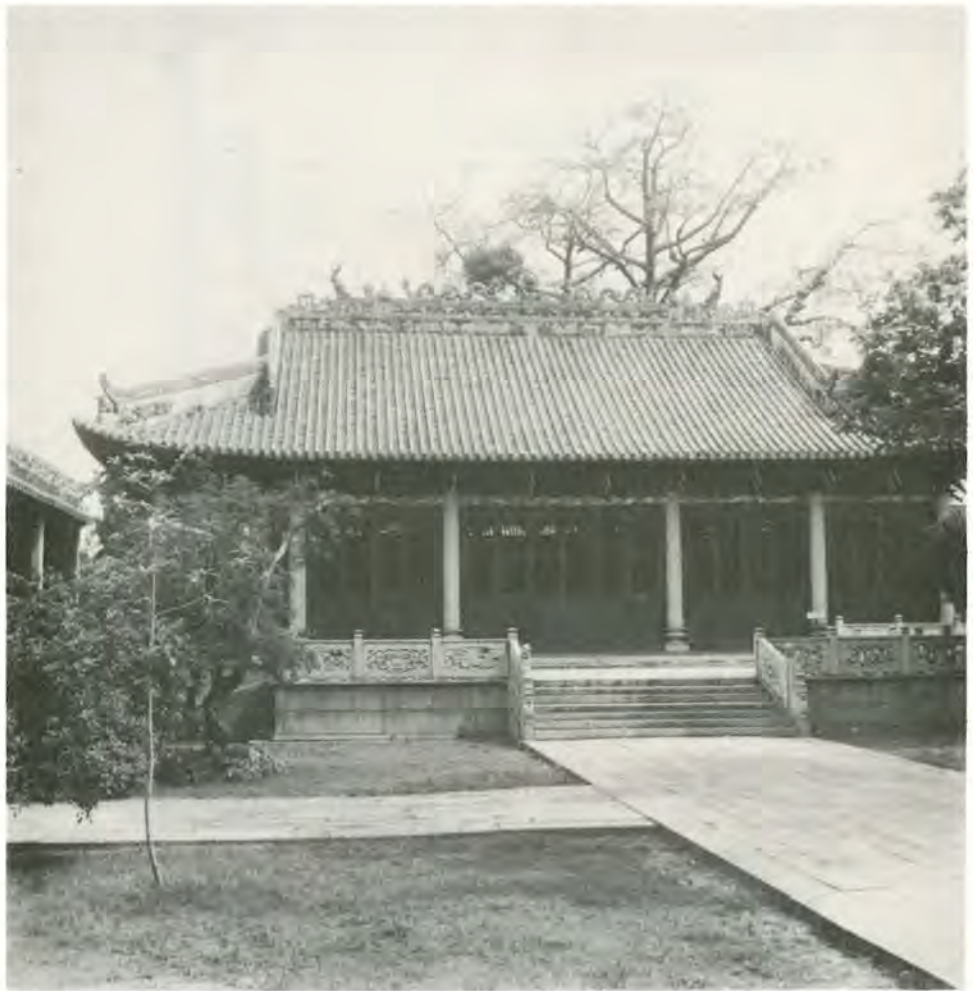
People's Movement Institute, Canton Mao-tse-tung and others trained and planned here for the Revolution

The future is therefore uncertain, though none can doubt China's importance as a world power. But something far more profound has happened to China. Six hundred million peasants (out of a population of 800 million) have experienced a revolution in their attitudes and their values. The echoes of this are spreading like shock waves round the world. It is with this revolution in consciousness that governments and individuals are going to have to come to terms. Christians, who worship, as their Lord, the poor carpenter of Nazareth should be among the first to rejoice.