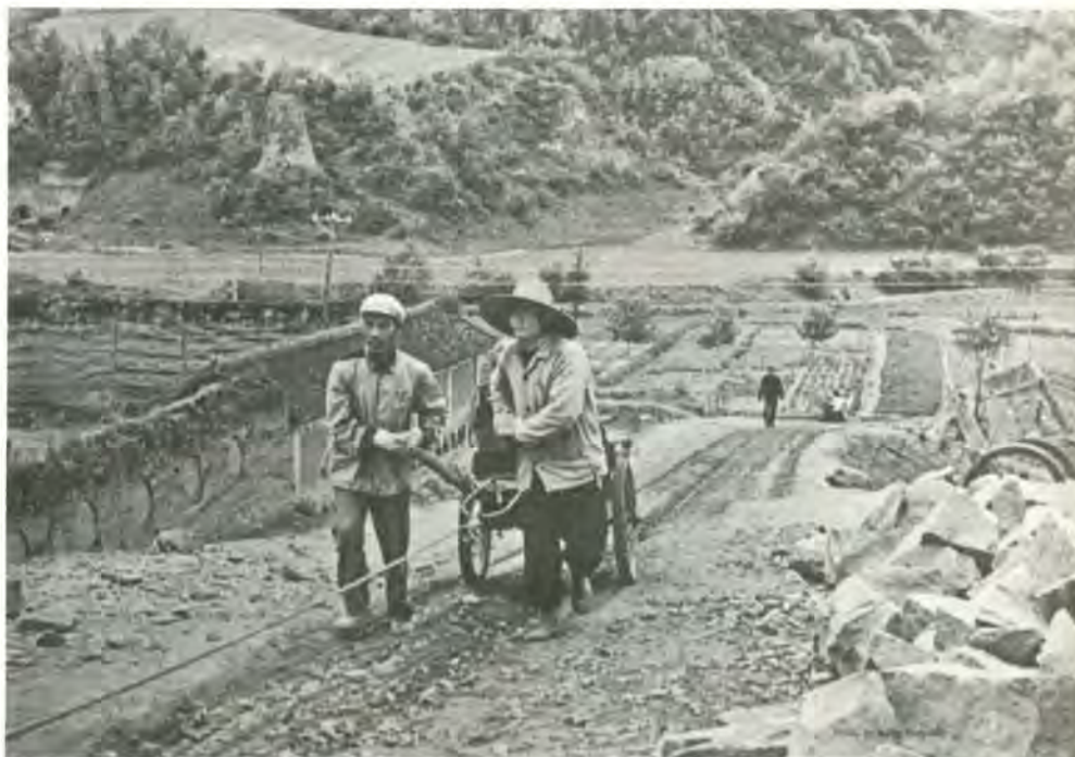
Farming near Peking

Is there not here a message of warning and challenge to us in the west also?