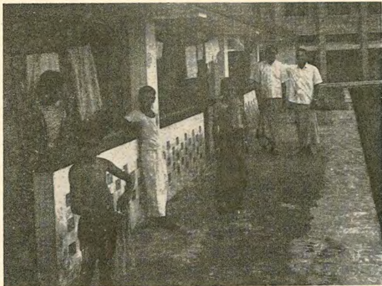
The private cabins looking towards the two storey block; ground floor, female ward; first floor, Nurses' Training School.