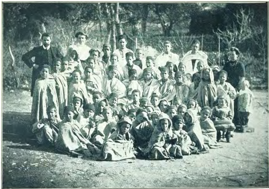
Kabyle Sunday-School, Djemâa Sahridj.