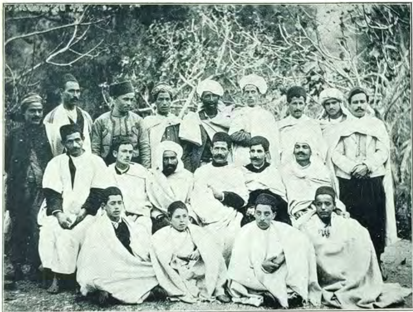
First Conference of Kabyle Christians.