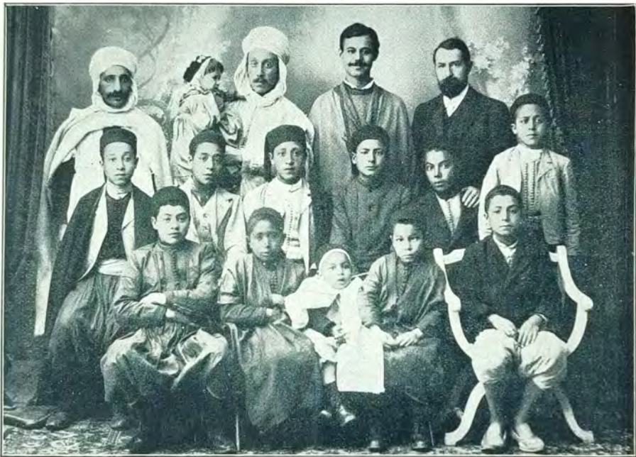
Boys' Training Home and Staff: Constantine.