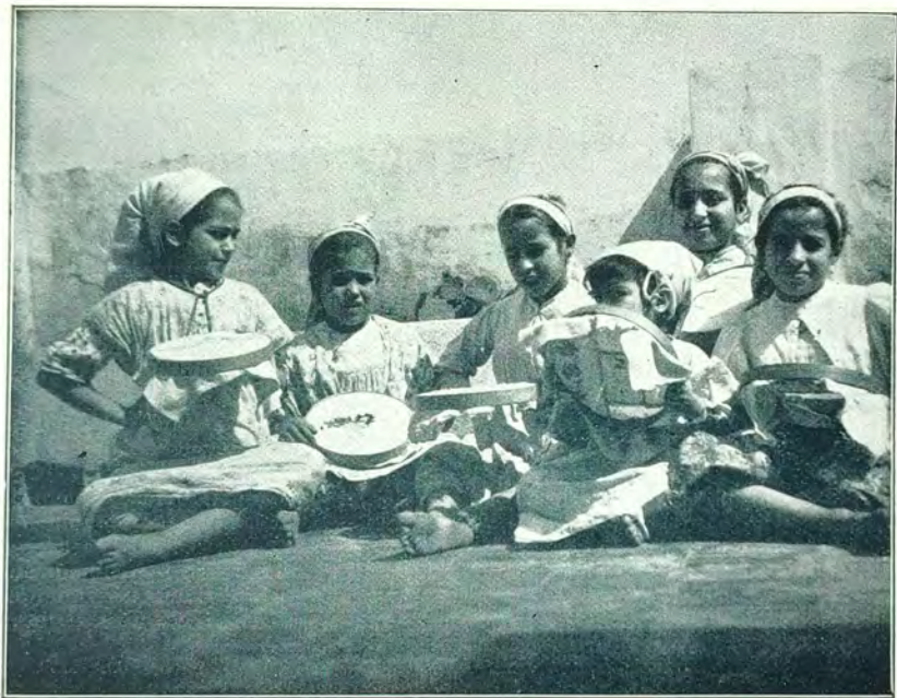
Arab Girls' Industrial Class, Algiers.