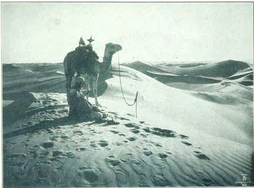
"Sun and Sand": The Sahara.