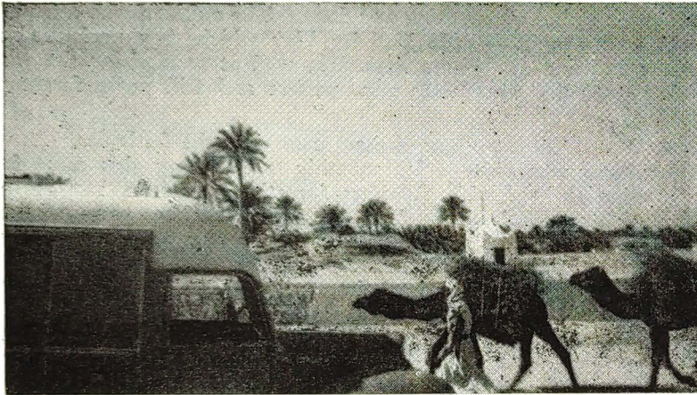
Camels passing B. & F.B.S. Caravan at Ouargla.

These are always the impressions uppermost in my mind on my return from any desert trip nowadays; the spiritual implications are